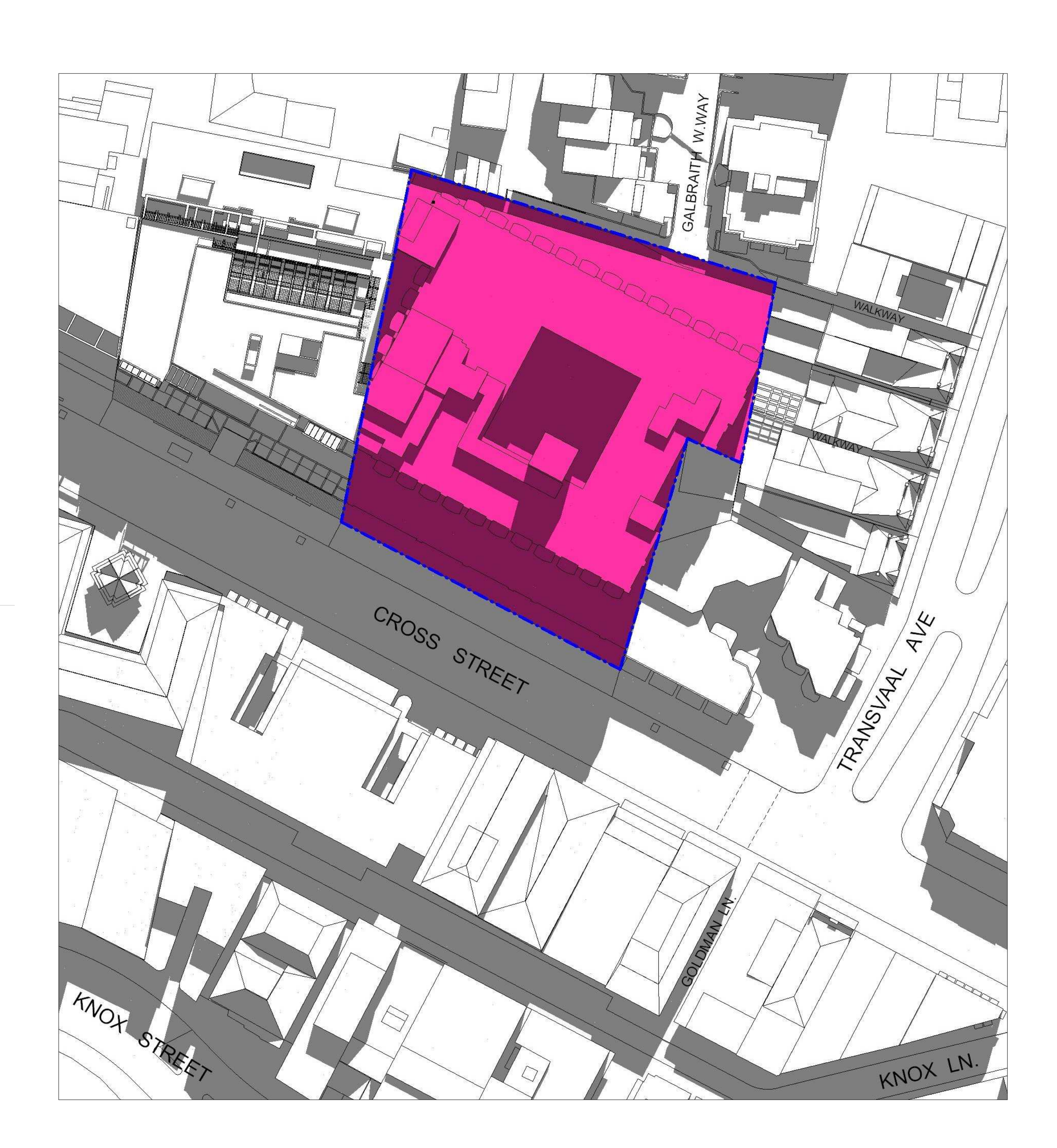
IMMEDIATE IMPACT - 21st JUNE 12pm EXISTING