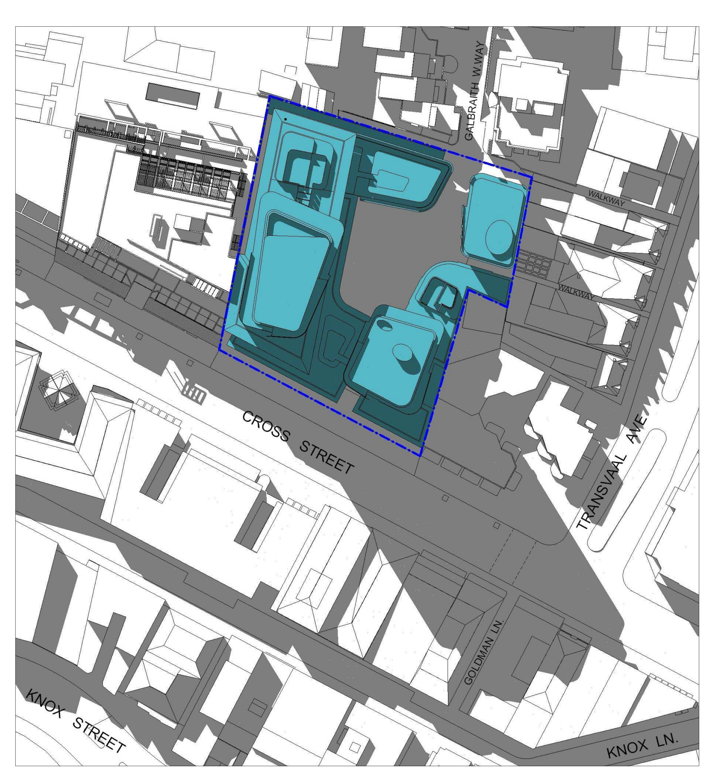
IMMEDIATE IMPACT - 21st JUNE 3pm PPR SCHEME