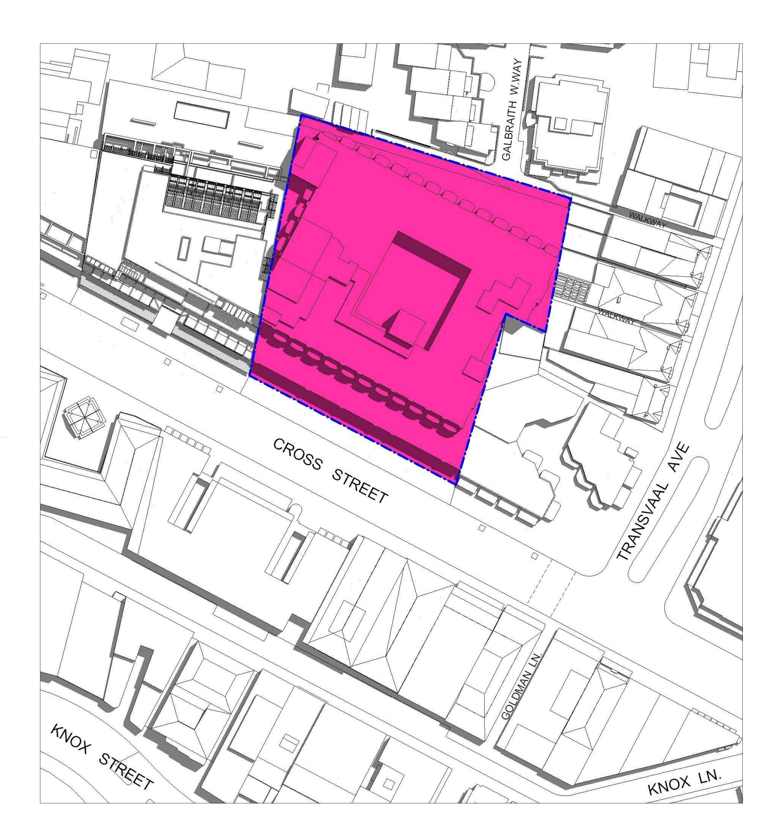
IMMEDIATE IMPACT - 21st DECEMBER 12pm EXISTING