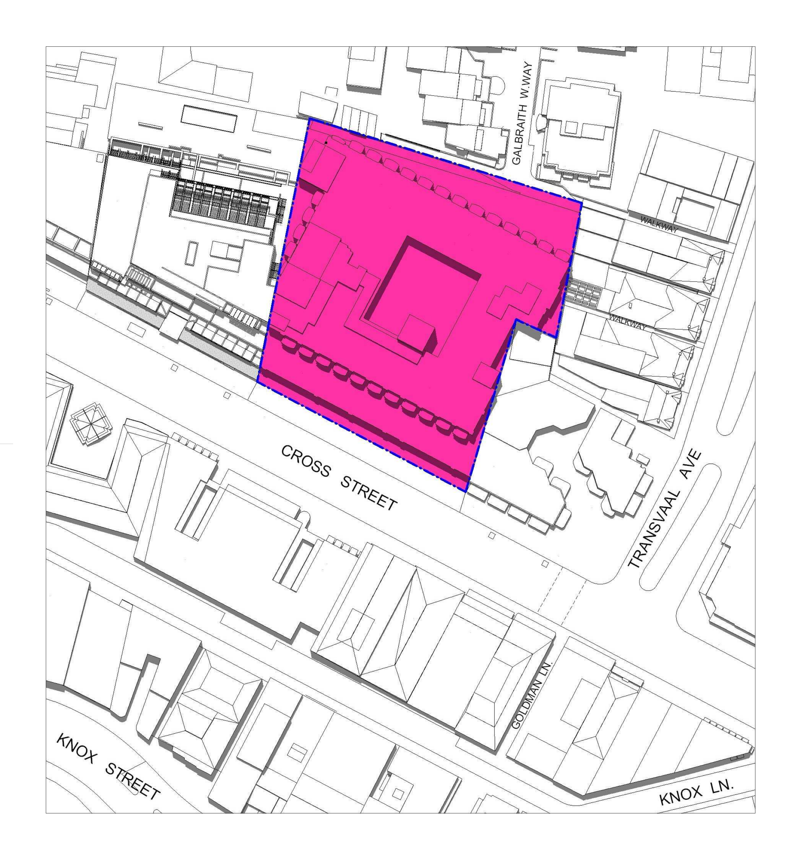
IMMEDIATE IMPACT - 21st DECEMBER 1pm EXISTING