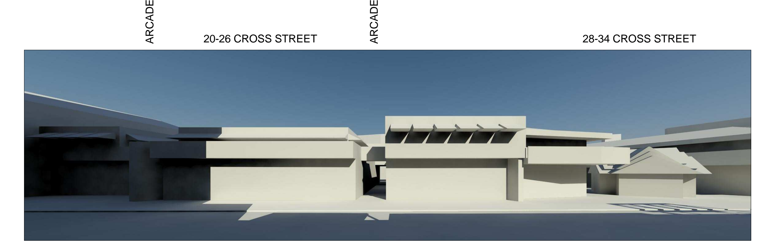
PERSPECTIVE C - 21st JUNE 1pm PROPOSED