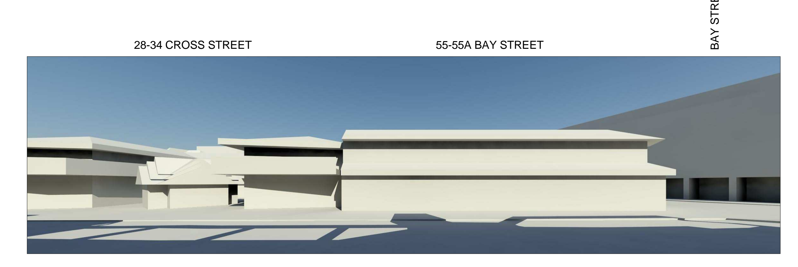
PERSPECTIVE D - 21st JUNE 1pm EXISTING