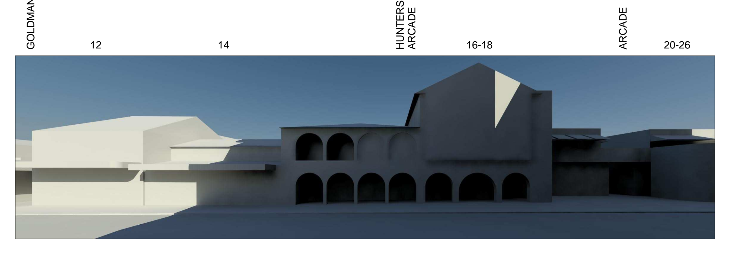
PERSPECTIVE B - 21st JUNE 1pm PROPOSED