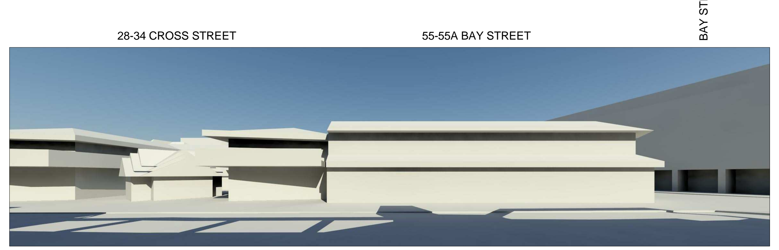
PERSPECTIVE D - 21st JUNE 1pm PROPOSED