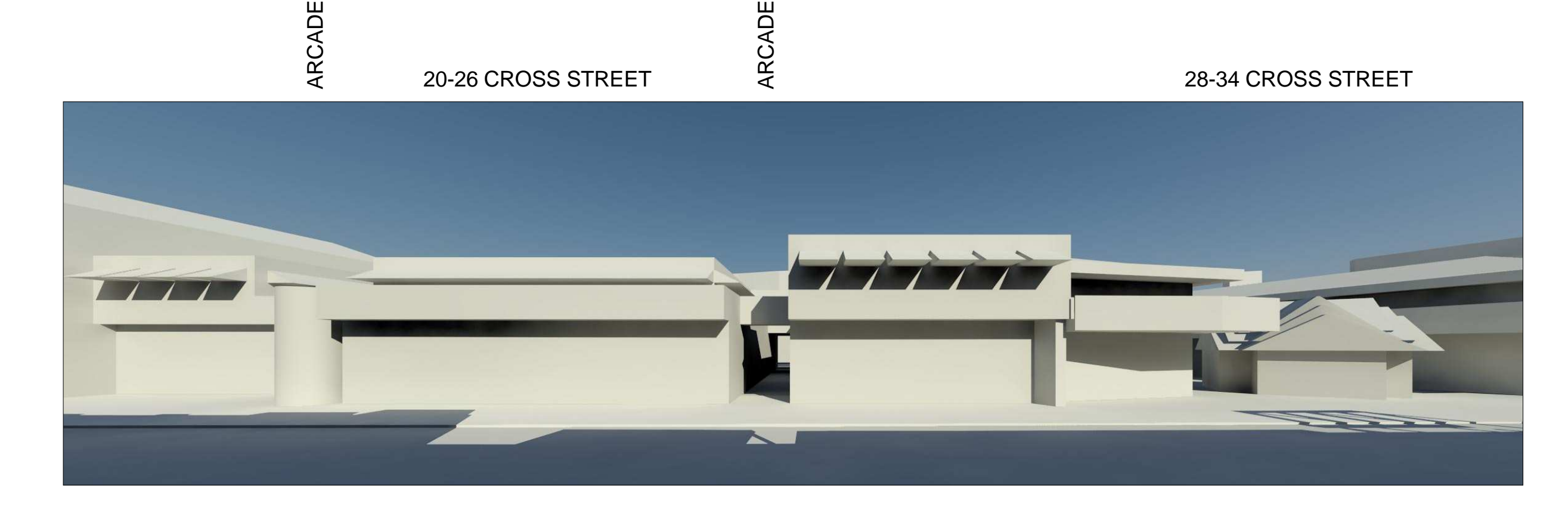
PERSPECTIVE C - 21st JUNE 1pm EXISTING