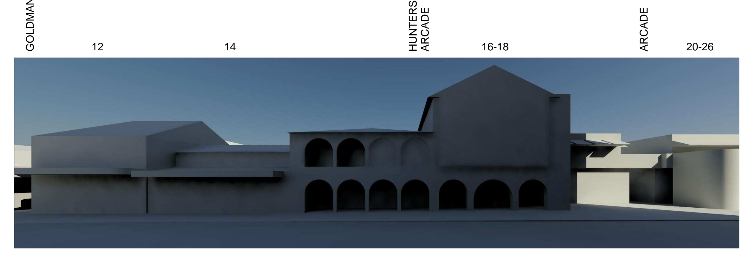
PERSPECTIVE B - 21st JUNE 2pm PROPOSED