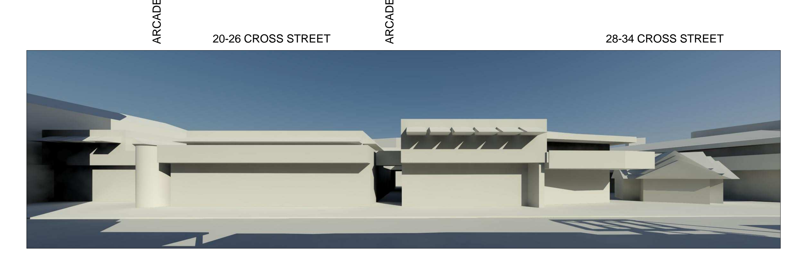
PERSPECTIVE C - 21st JUNE 2pm PROPOSED