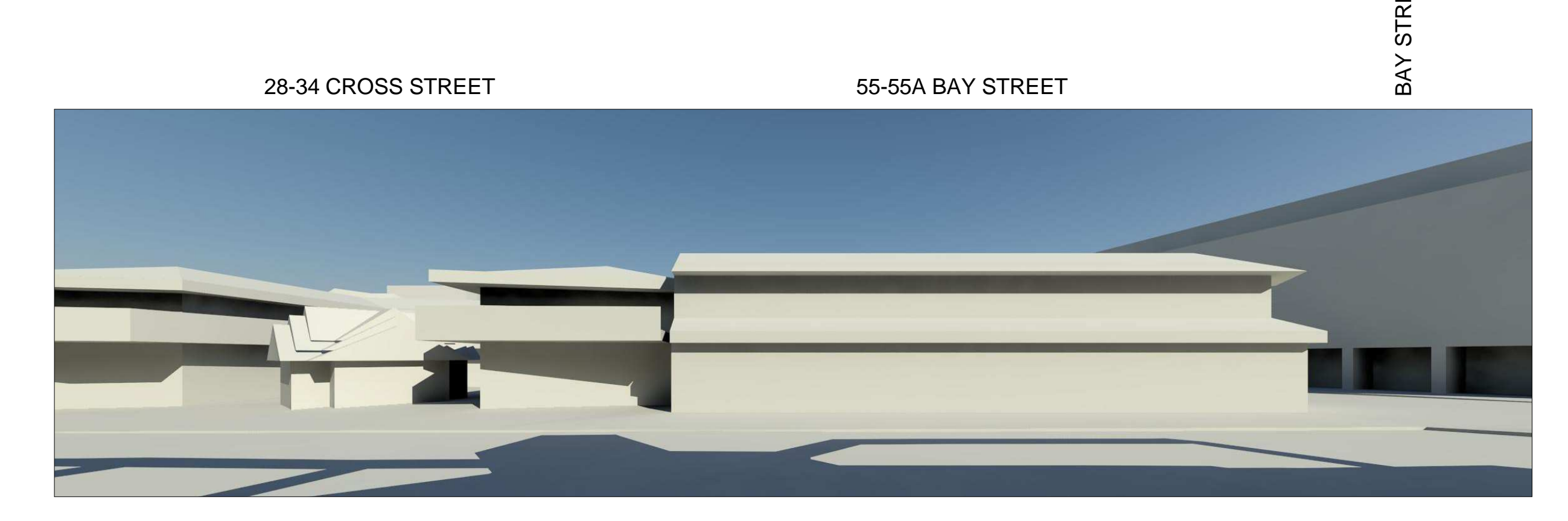
PERSPECTIVE D - 21st JUNE 2pm EXISTING