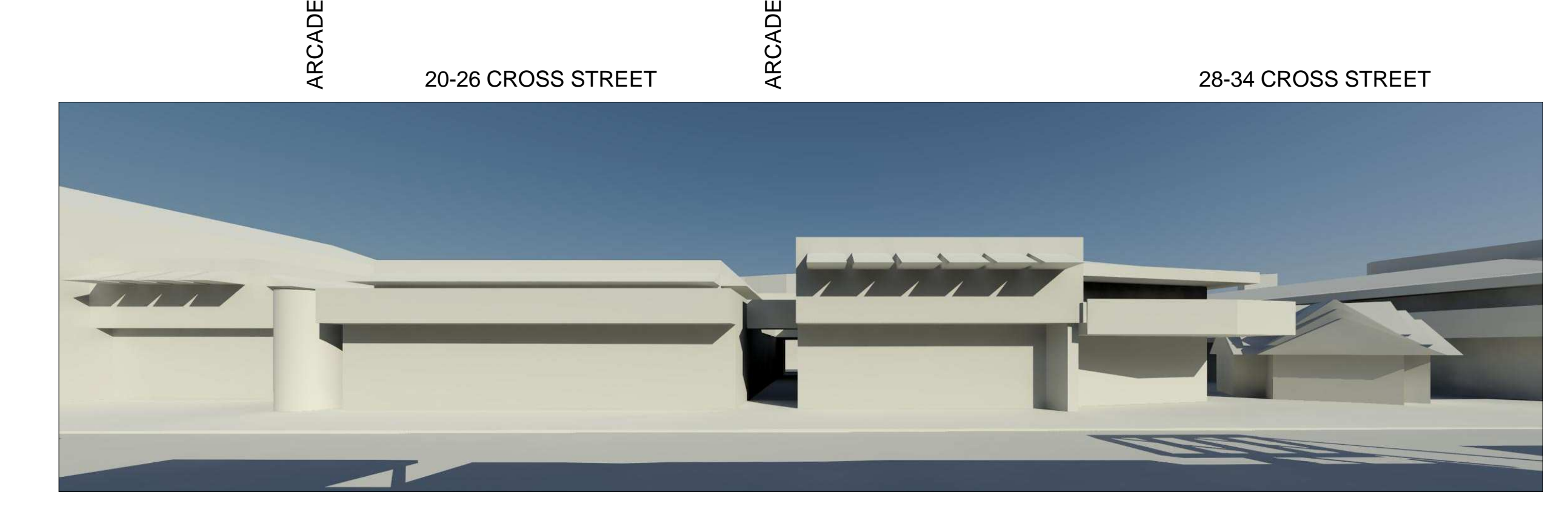
PERSPECTIVE C - 21st JUNE 2pm EXISTING