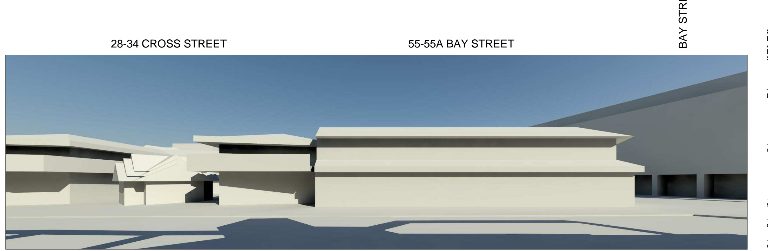
PERSPECTIVE D - 21st JUNE 2pm PROPOSED

part, nor may the information, ideas and concepts therein contained (which are confidential to Architectus Sydney Pty Ltd) be disclosed to any person without the prior written consent of