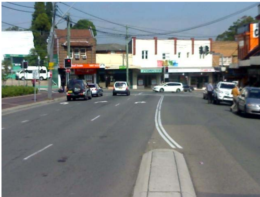
Figure 9 West Parade southbound approach to Victoria Road