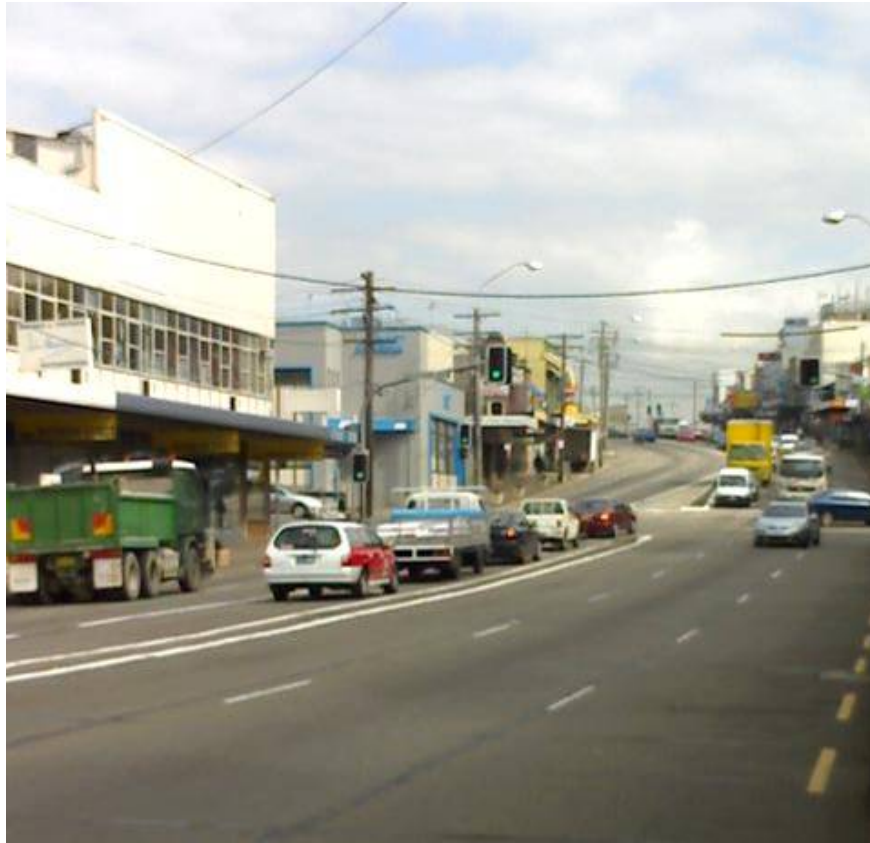
Figure 7 Victoria Road looking west from West Parade

Chatham Road and West Parade intersect with Victoria Road and provide a distributor road function for north-south traffic accessing the West Ryde town centre and the residential precinct to the north. Chatham Road is a 12.8m wide road generally configured as a traffic lane in each direction with kerbside car parking. At the Dickson Avenue roundabout, Chatham Road continues with a single lane in each direction and no car parking until the north of Betts Street.