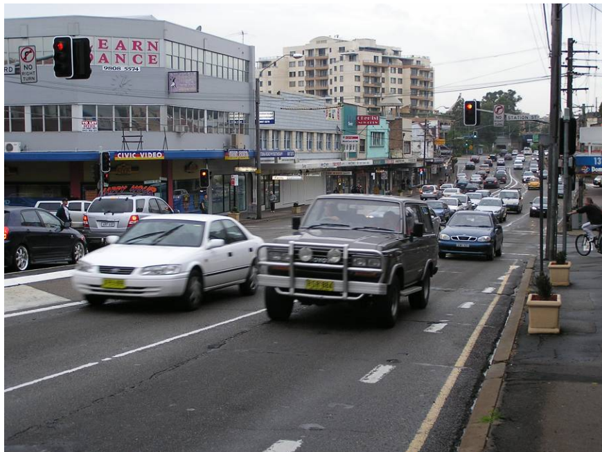
Figure 6 Victoria Road looking east from Chatham Road