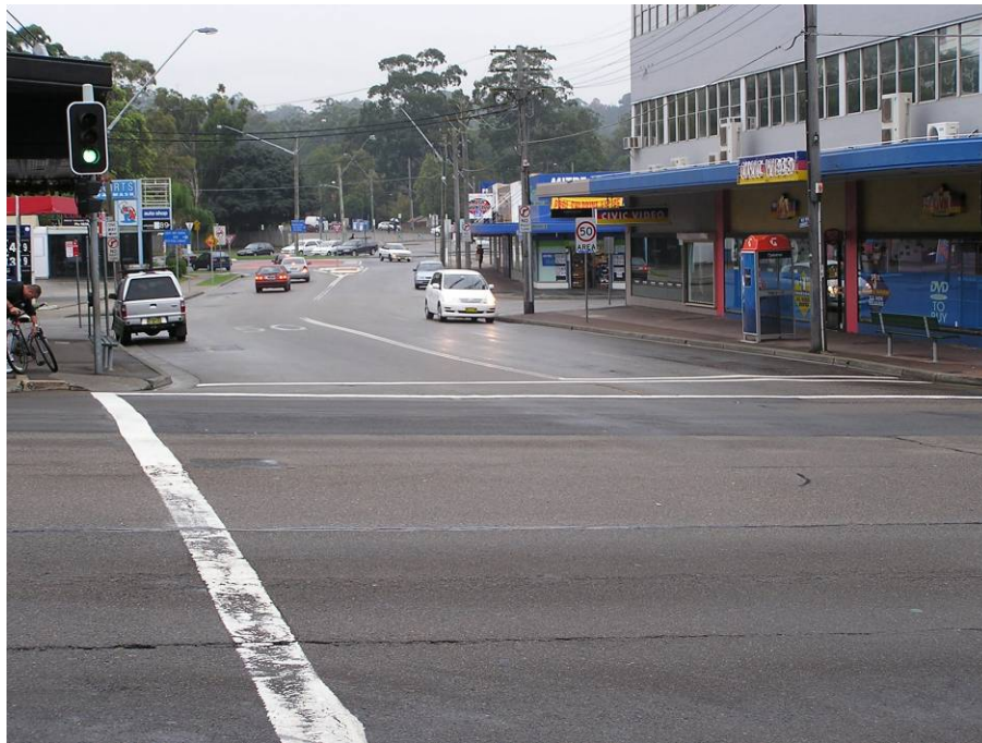
Figure 8 Chatham Road looking north from Victoria Road