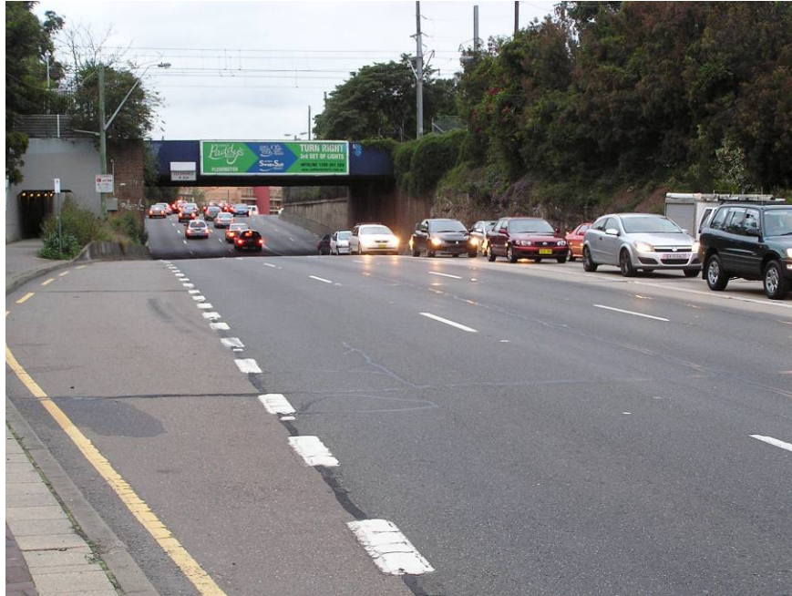
Figure 5 Victoria Road looking east from West Parade

Victoria Road is the major arterial road in the area running east-west. It is generally configured as three eastbound lanes and two westbound lanes to the east of Chatham Road due to the constriction under the railway line (Figure 2) and the right turn bay into Chatham Road (Figure 3). The right turn bay into Chatham Road currently accommodates approximately 12 vehicles.