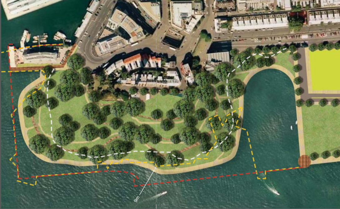
Publicly Exhibited Profile