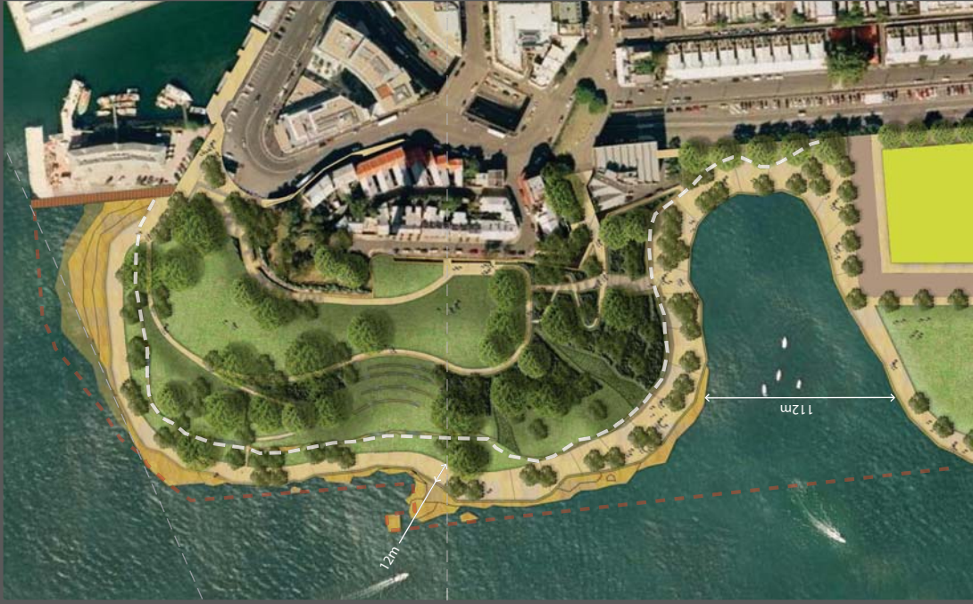
Design Developed Profile (Preferred for Lodgement) Rev D