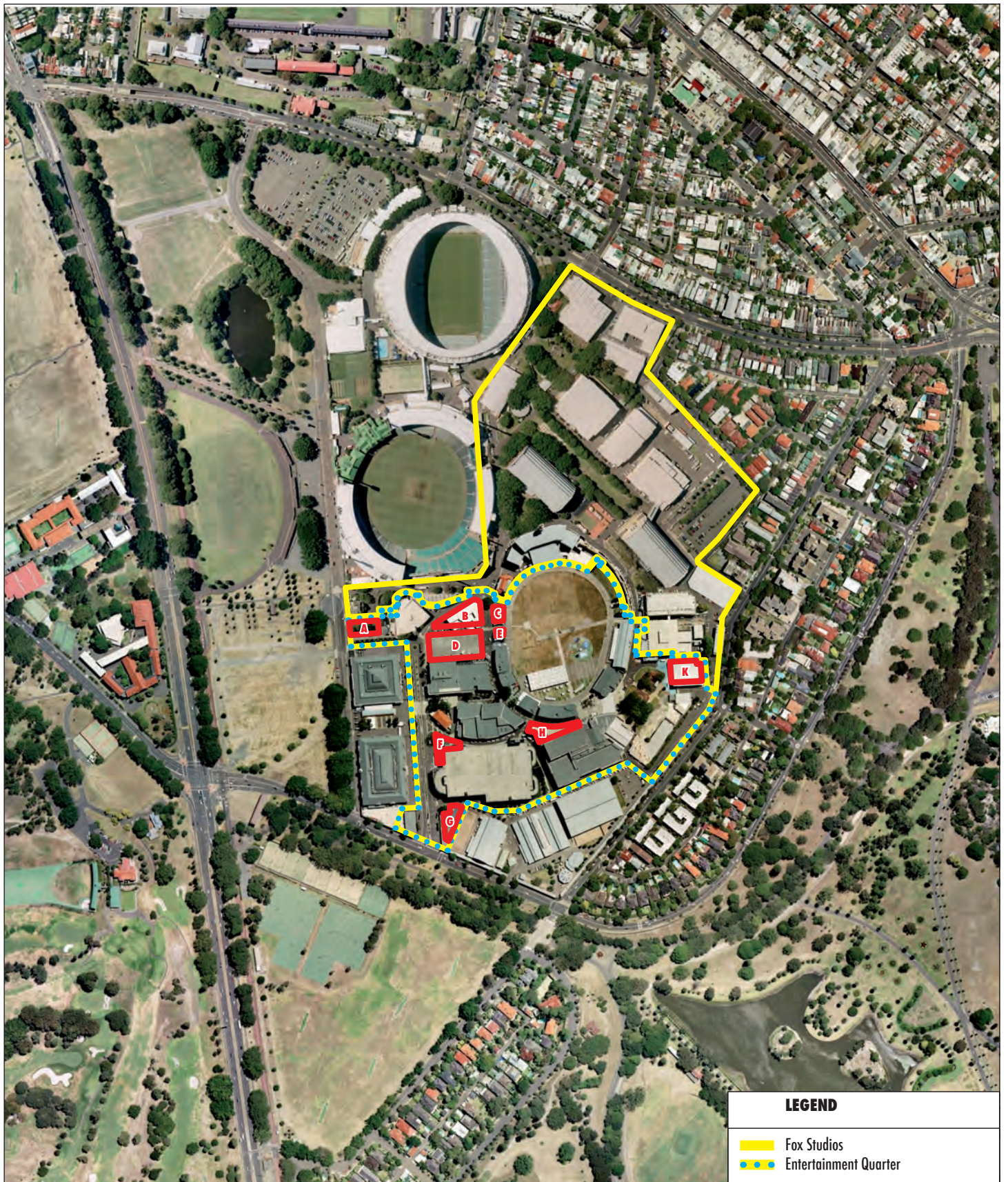
FIGURE 3A Aerial Photo - Wider Area - 2008