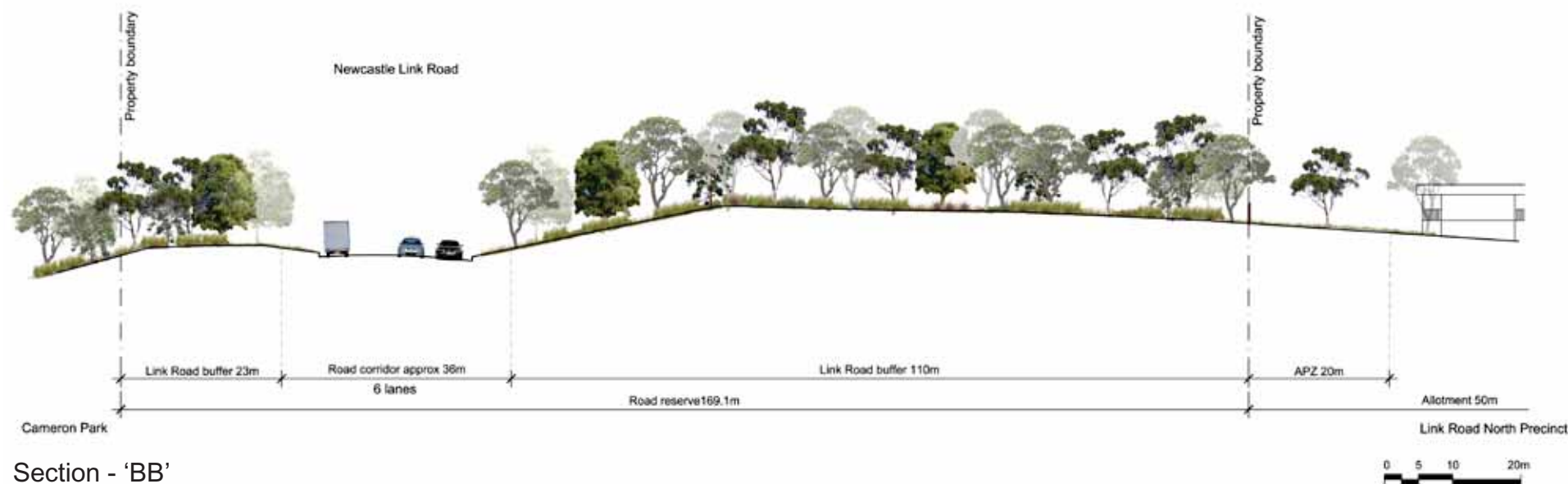
Section - 'BB'