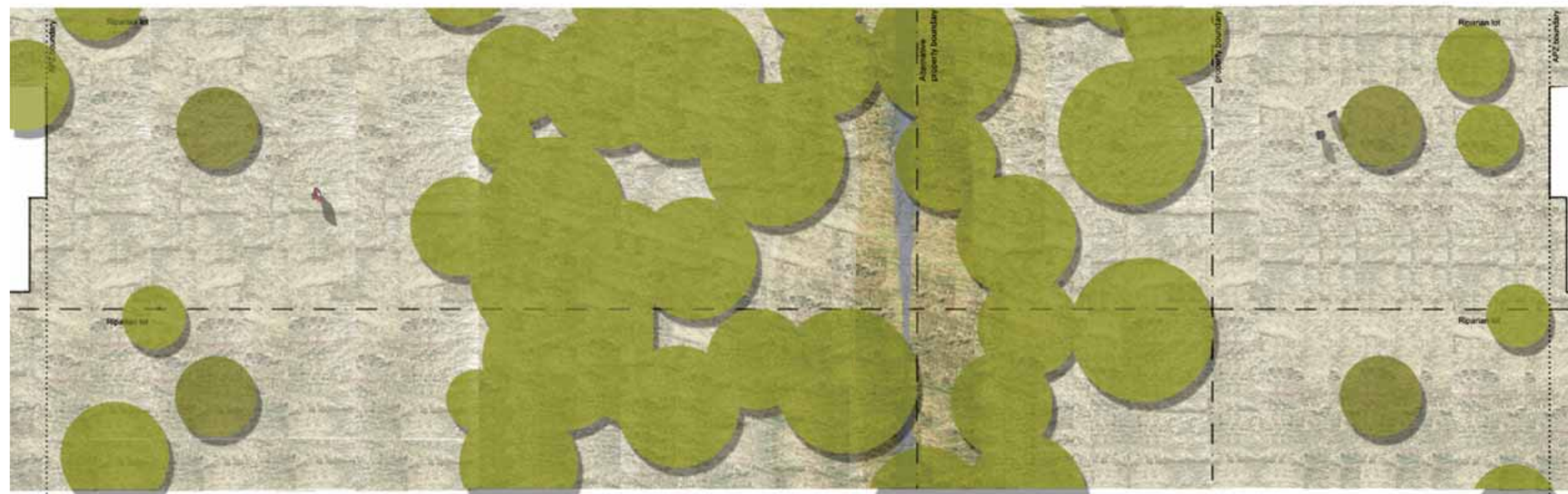
Riparian Cross-Section: Riparian zone within lot boundaries

Project: Coal & Allied Northern Estate Minmi - Link Road Section: Riparian Section - within lot boundaries Section 13-13 Date: 25.08.2009