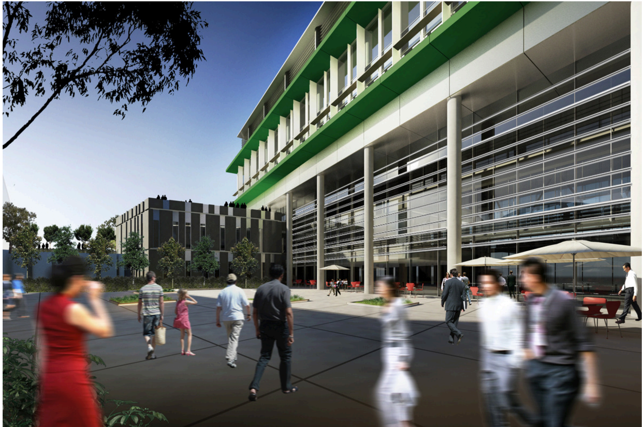
View from Courtyard

Level 2, 204 Clarence Street, Sydney 2000 Australia Tel : 612 9267 9599 Fax : 612 9264 5844 Email : sydney@cox.com.au