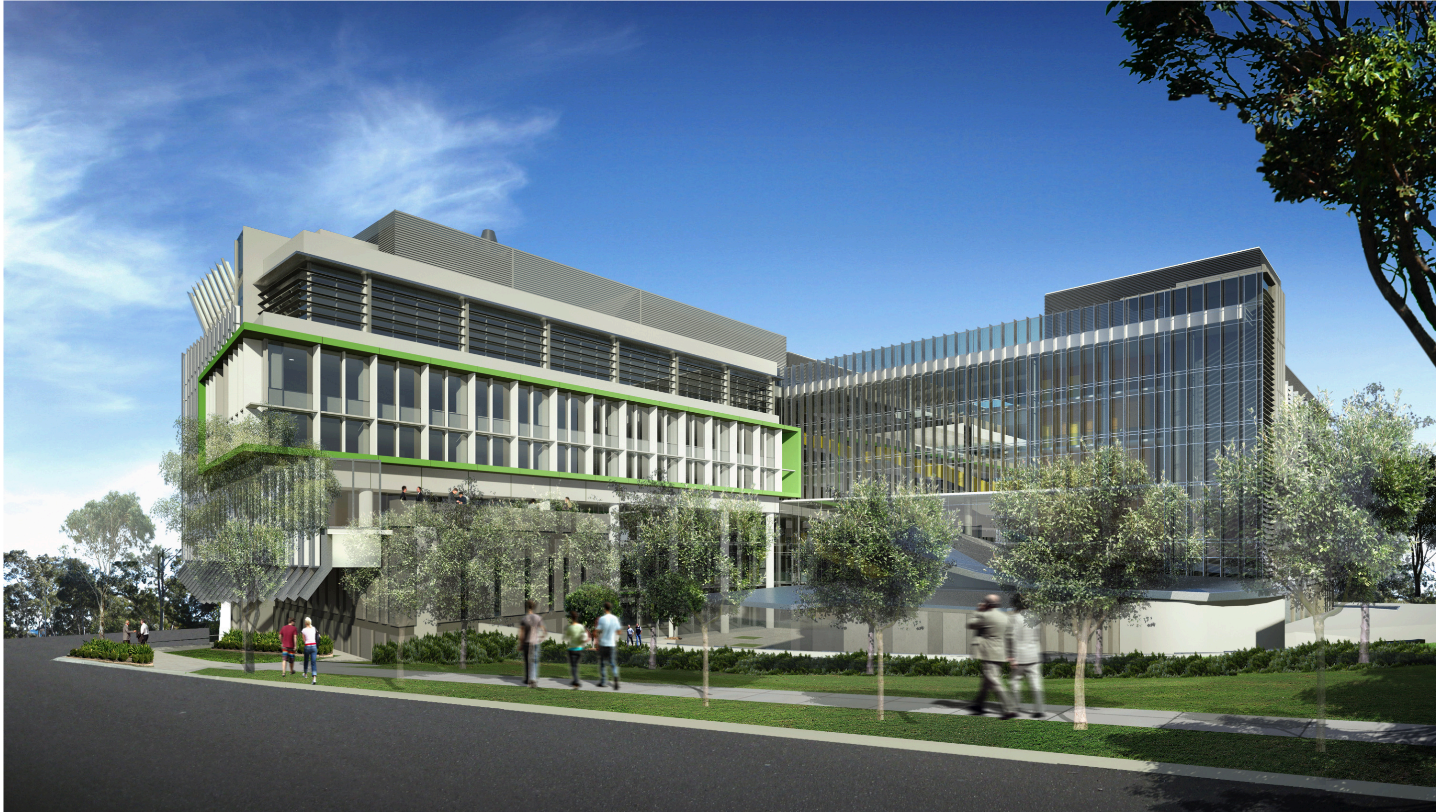
View from Easy Street

Cox Richardson Level 2, 204 Clarence Street, Sydney 2000 Australia Tel : 612 9267 9599 Fax : 612 9264 5844 Email : sydney@cox.com.au