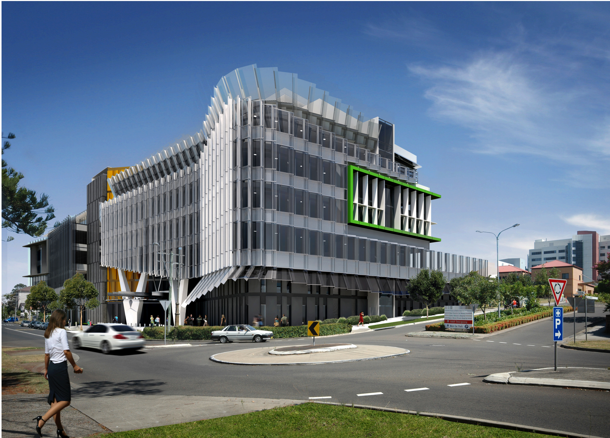
View from Corner Easy Street & Barker Street

Cox Richardson Level 2, 204 Clarence Street, Sydney 2000 Australia Tel : 612 9267 9599 Fax : 612 9264 5844 Email : sydney@cox.com.au