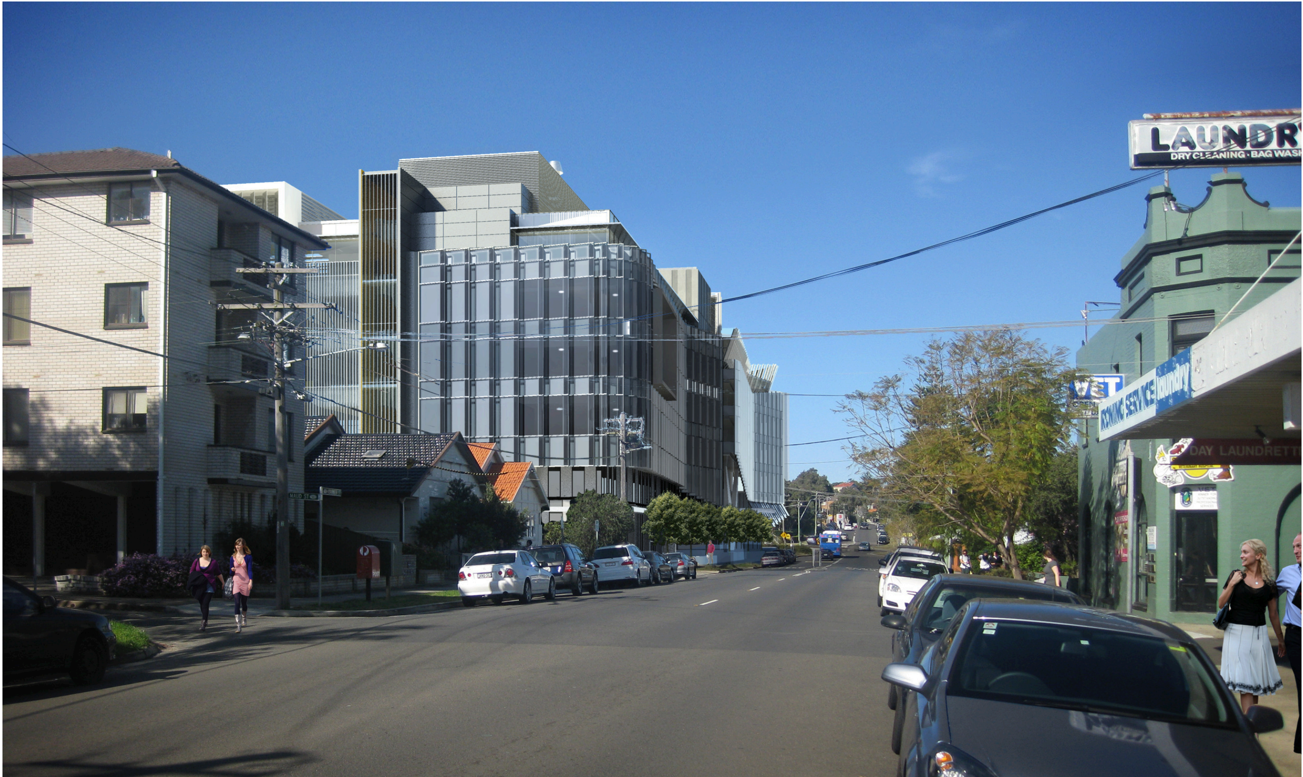
View of Hospital Road & Barker Street Corner

Level 2, 204 Clarence Street, Sydney 2000 Australia Tel : 612 9267 9599 Fax : 612 9264 5844 Email : sydney@cox.com.au