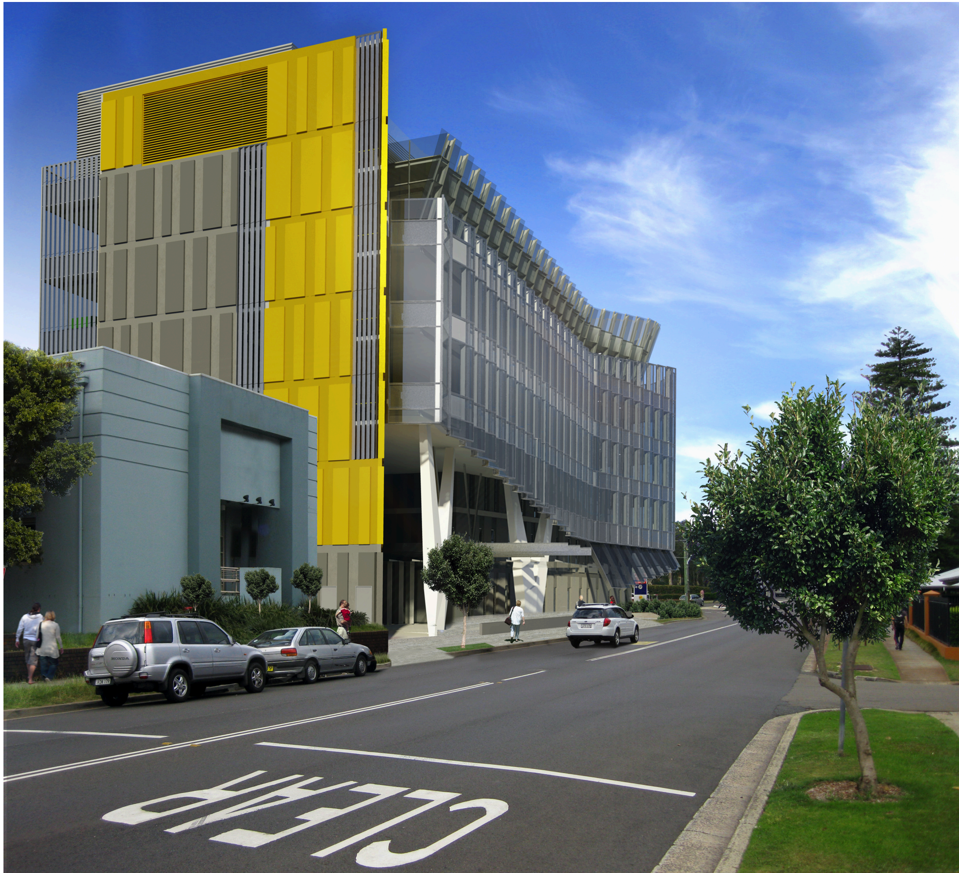
View from Barker Street Stage 2A

Level 2, 204 Clarence Street, Sydney 2000 Australia Tel : 612 9267 9599 Fax : 612 9264 5844 Email : sydney@cox.com.au