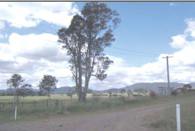
Photograph 2 View looking north-east towards the Stage 1 GFDA.