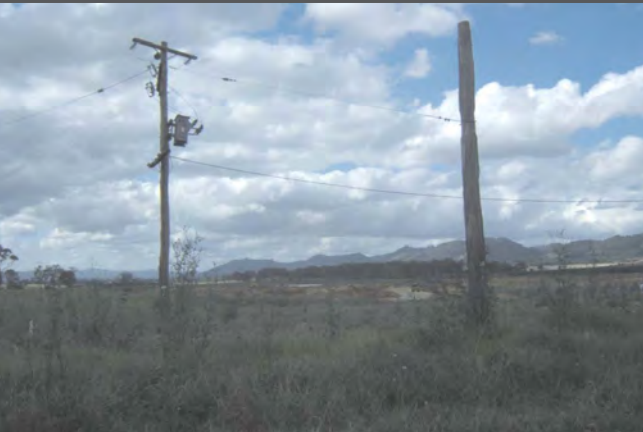
Photograph 5 View from Bowens Road within the Stage 1 GFDA looking north-east towards Stratford Colliery.