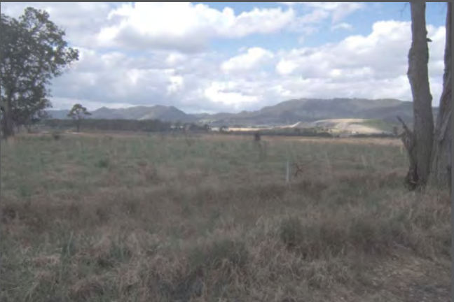
Photograph 6 View from Bowens Road within the Stage 1 GFDA looking east-north-east towards Stratford Colliery.