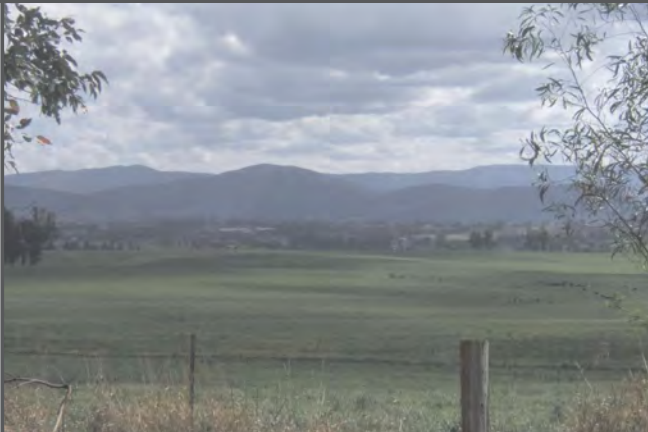
Photograph 4 View from McKinleys Lane within the Stage 1 GFDA looking south-west.