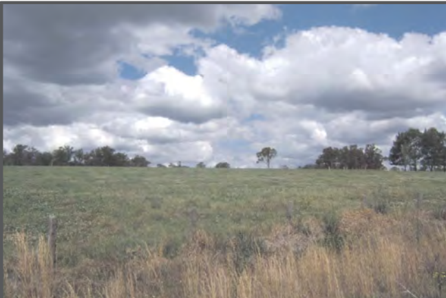
Photograph 1 View from The Bucketts Way near Stratford Colliery entrance looking east towards the Stage 1 GFDA.