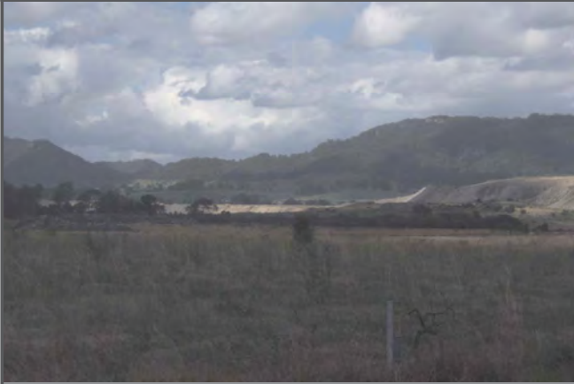
Photograph 7 View from Bowens Road within the Stage 1 GFDA looking east-north-east towards Stratford Colliery.