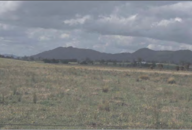
Photograph 8 View from Wenham Cox Road near Wheatlys Road within the Stage 1 GFDA looking north.