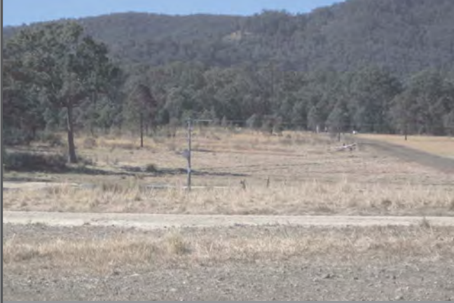
Photograph 10 View towards an existing production well on Tiedemans Property which is part of the Stratford Pilot Project.