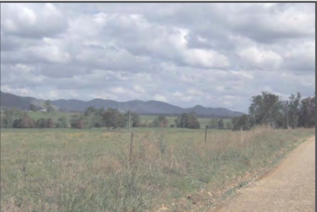
Photograph 3 View from Maslens Lane near a residence within the Stage 1 GFDA looking south-east.