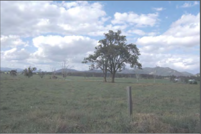
Photograph 9 View from Wenham Cox Road within the Stage 1 GFDA looking north.