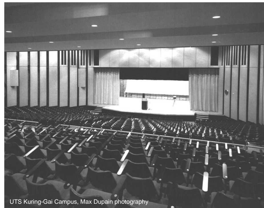
UTS Kuring-Gai Campus