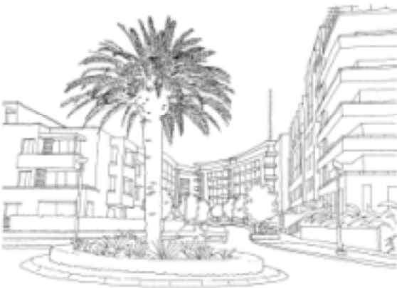
View along Amalfi Drive from the east