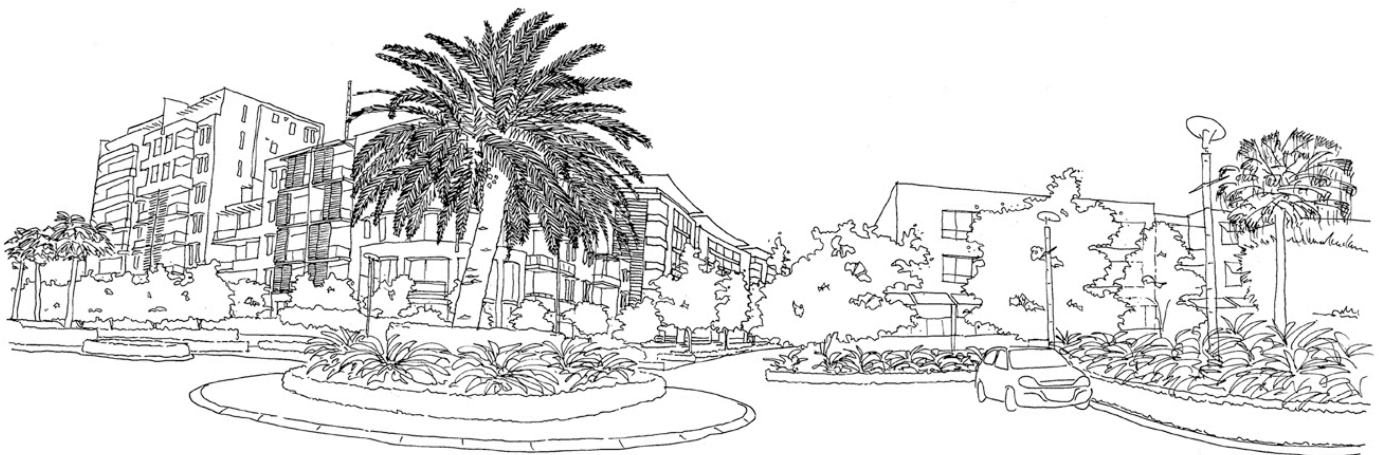
View from The Piazza