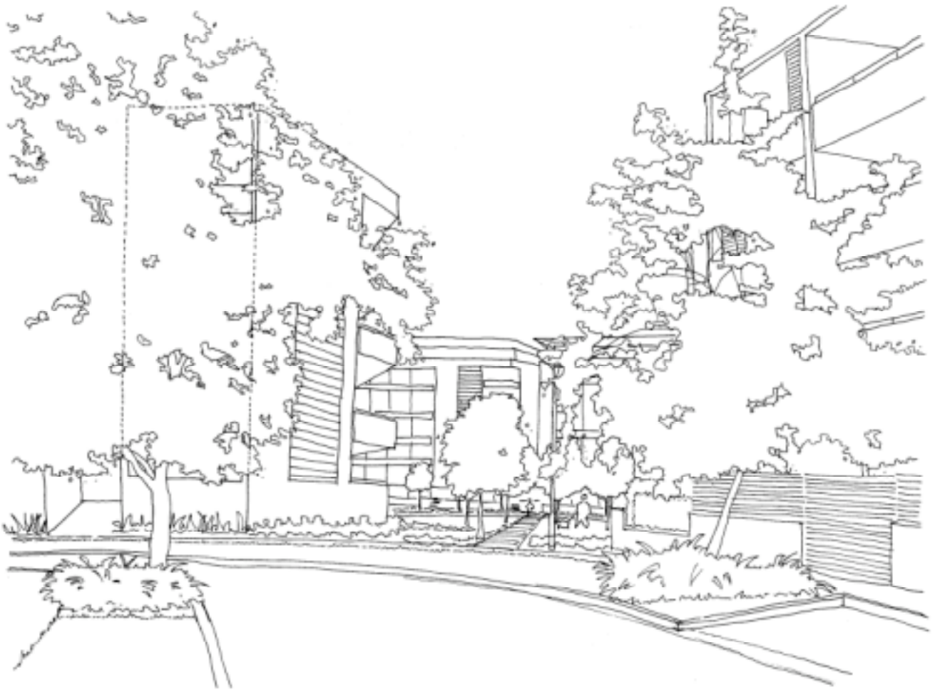
View into the site across the park