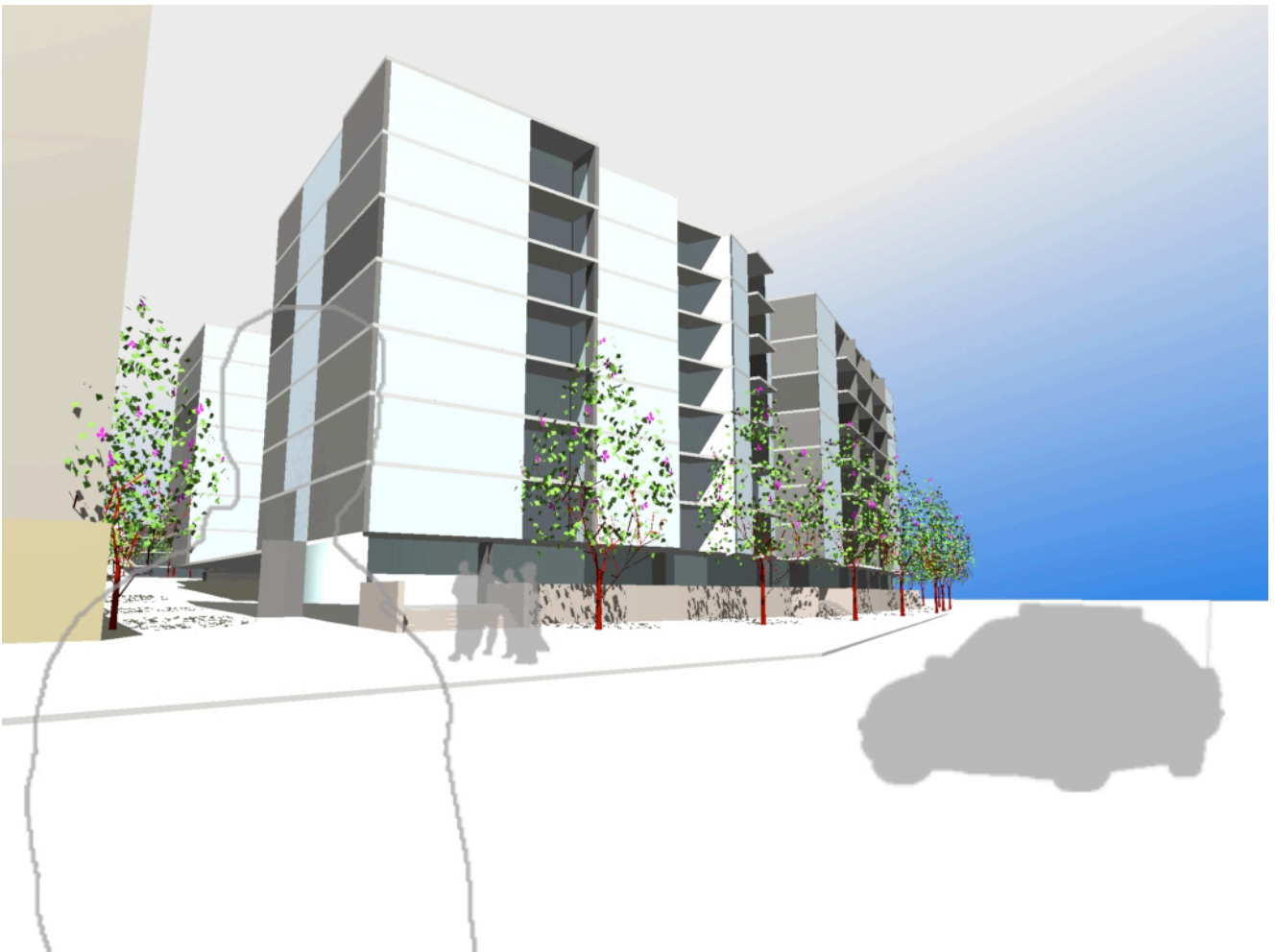
View along Bennelong Parkway