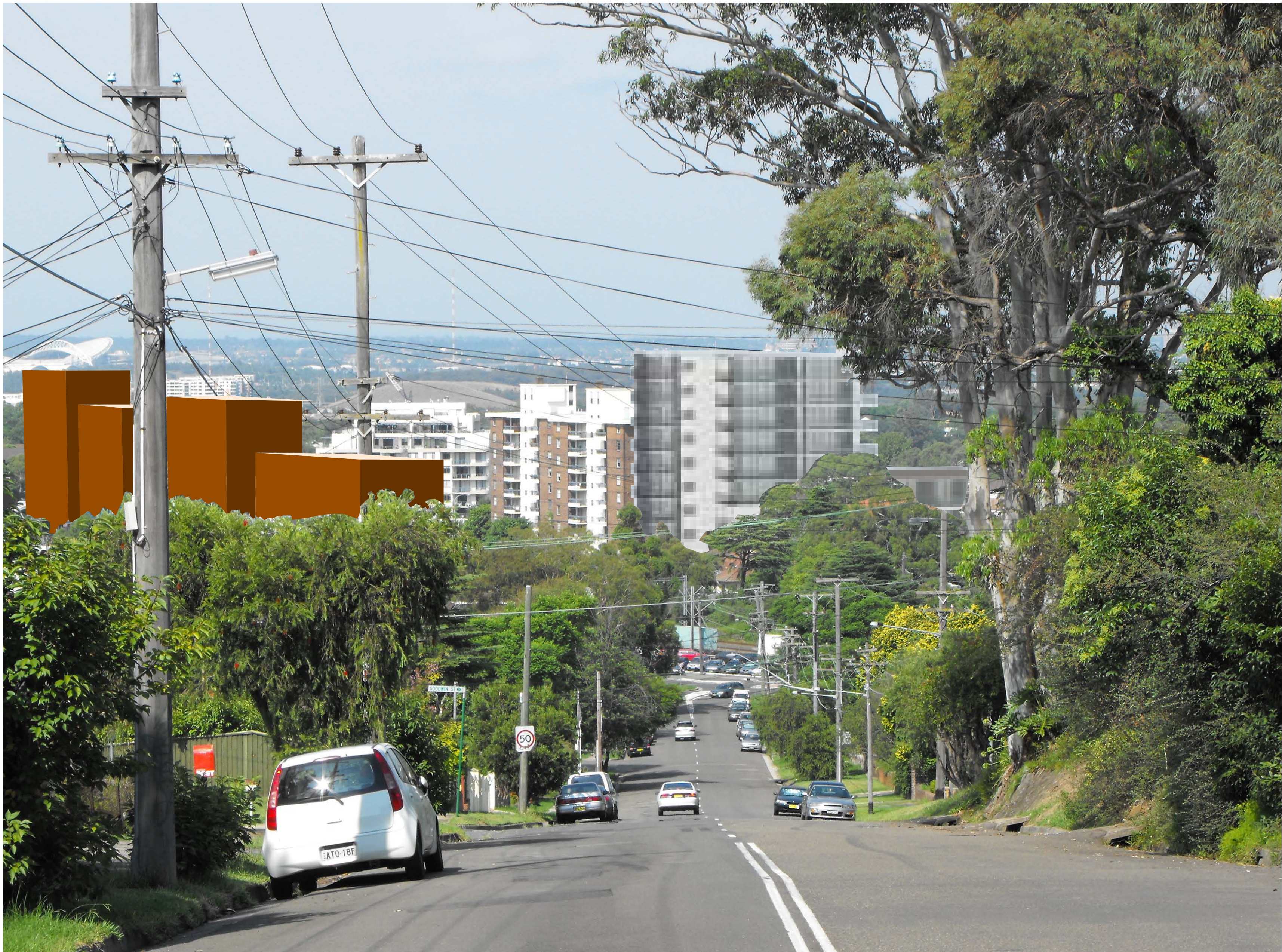
SOUTH - WEST VIEW FROM TERRY ROAD

CALDIS ARCHITECTS LEVEL 2, 45 CHIPPEN STREET CHIPPENDALE NSW 2008 TEL (02) 9319 3077 FAX (02) 9319 3577 ACN 051302900 Website: www.caldiscook.com Email: projects@caldiscook.com COOK ACN 051302900 Website: www.caldiscook.com Email: projects@caldiscook.com GROPP ACN 051302900 Website: www.caldiscook.com Email: projects@caldiscook.com