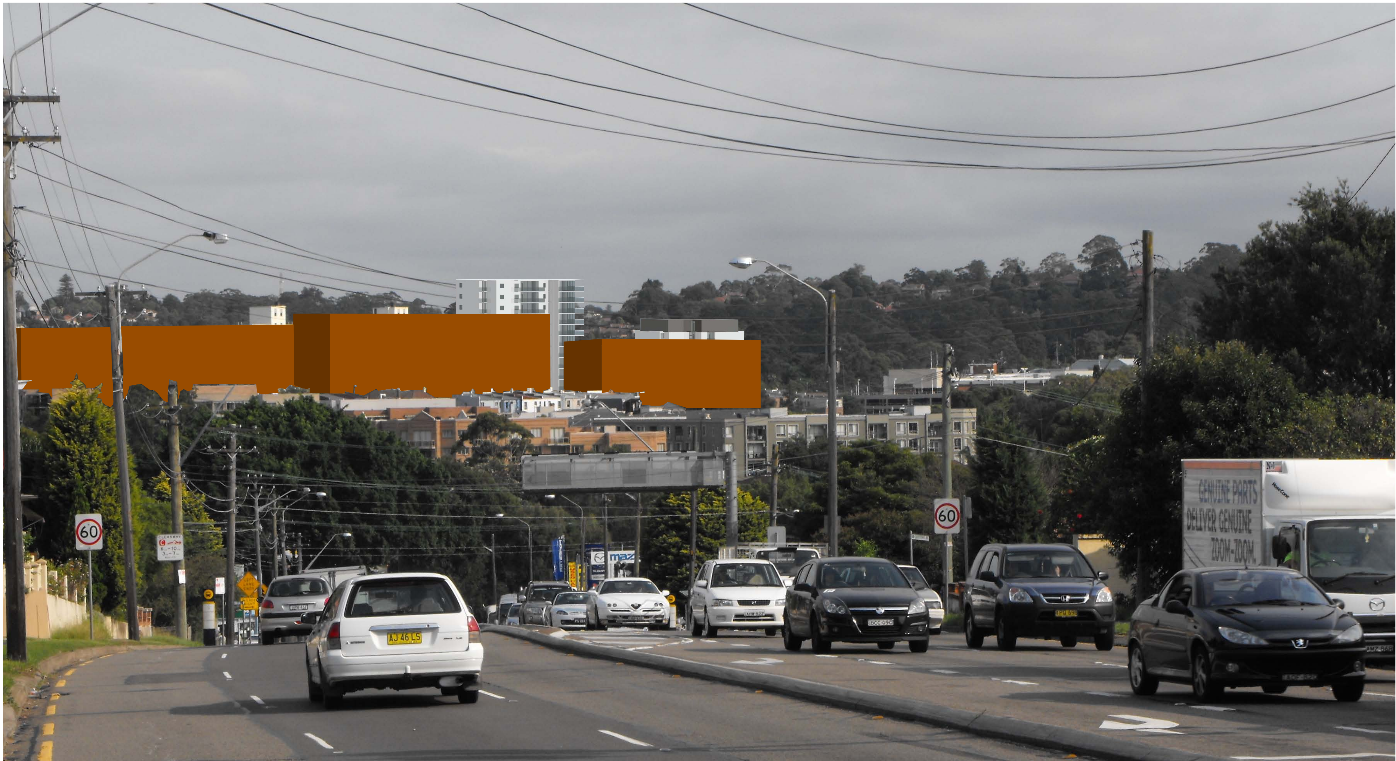
NORTH - WEST VIEW FROM VICTORIA ROAD

CALDIS ARCHITECTS LEVEL 2, 45 CHIPPEN STREET CHIPPENDALE NSW 2008 TEL (02) 9319 3077 FAX (02) 9319 3577 COOK ACN 051302900 Website: www.caldiscook.com Email: projects@caldiscook.com GROPP ACN 051 302 900