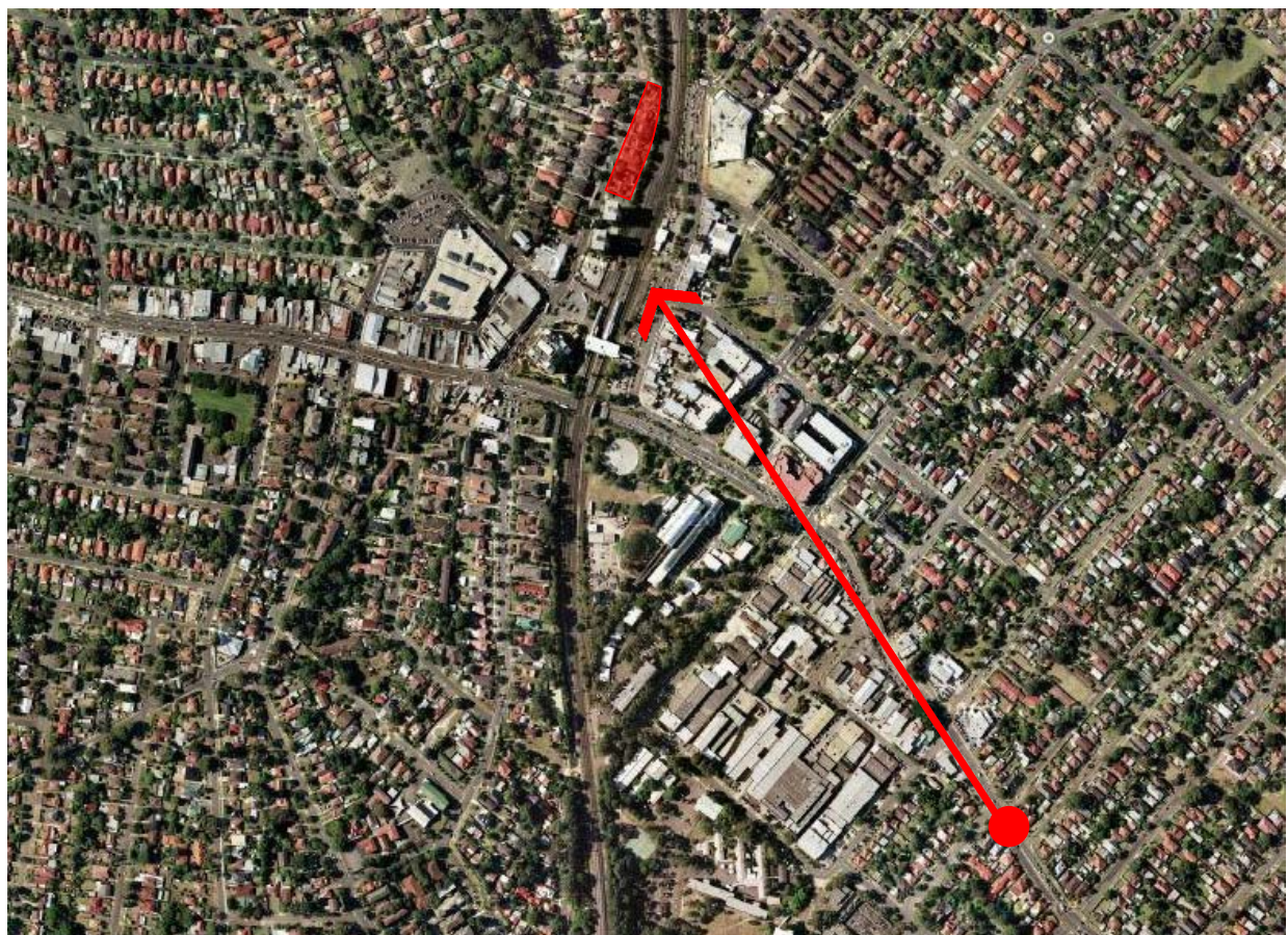
LOCATION WHERE PHOTO WAS TAKEN FROM

CLIENT HOUSING NSW PROJECT PREFERRED CONCEPT WEST RYDE HOUSING DEVELOPMENT 63-77 West Parade, West Ryde DRAWING PHOTOMONTAGE 2