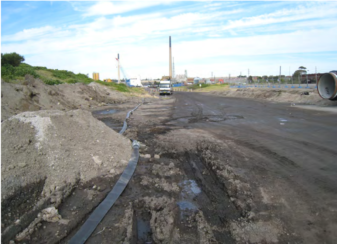
Plate 1: Photograph taken facing southeast and showing the Site