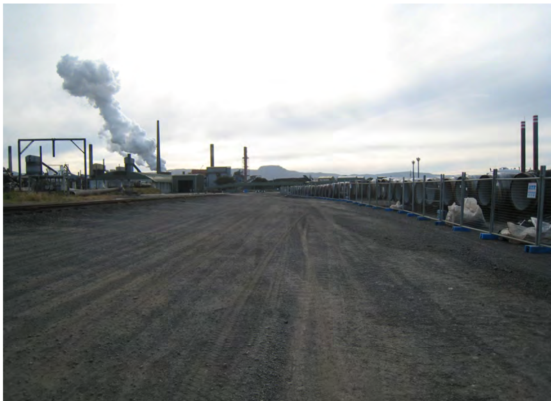
Plate 2: Photograph taken facing northwest and showing the Site