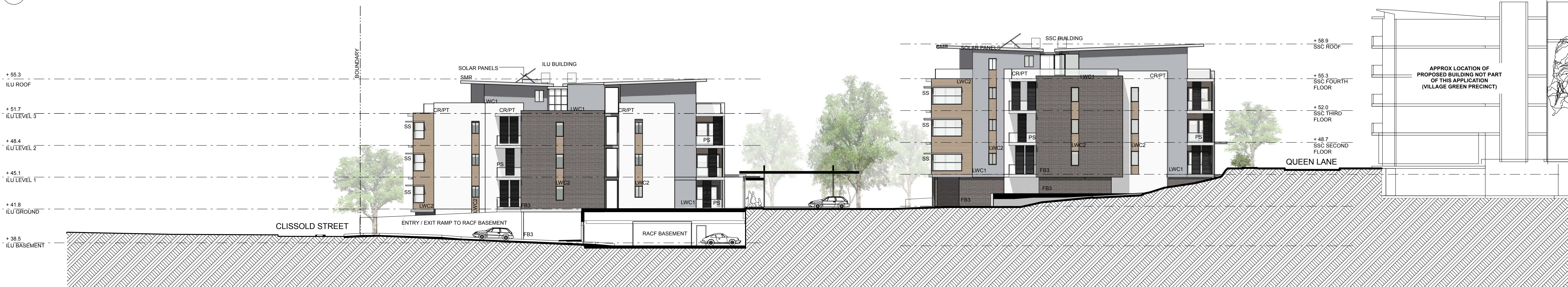
06 SECTION 06 SCALE 1:200 @ A1