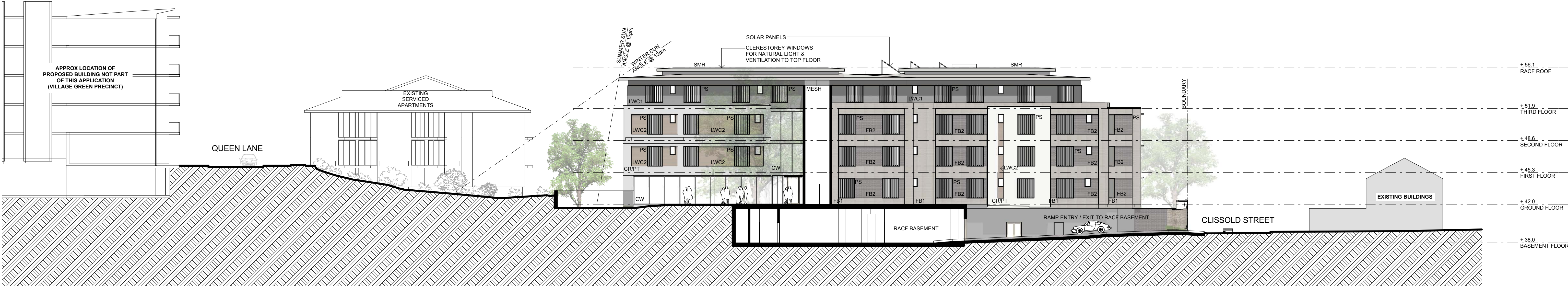
04 SECTION 04 SCALE 1:200 @ A1