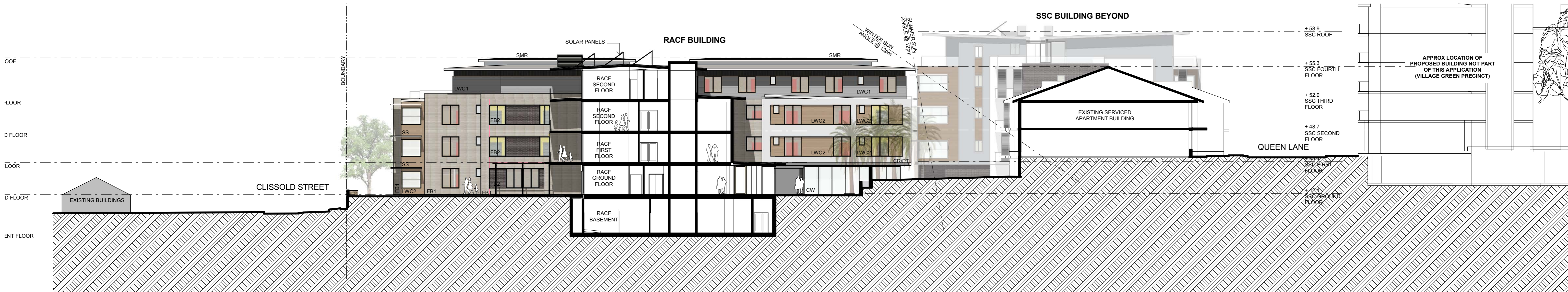
07 SECTION 07 SCALE 1:200 @ A1