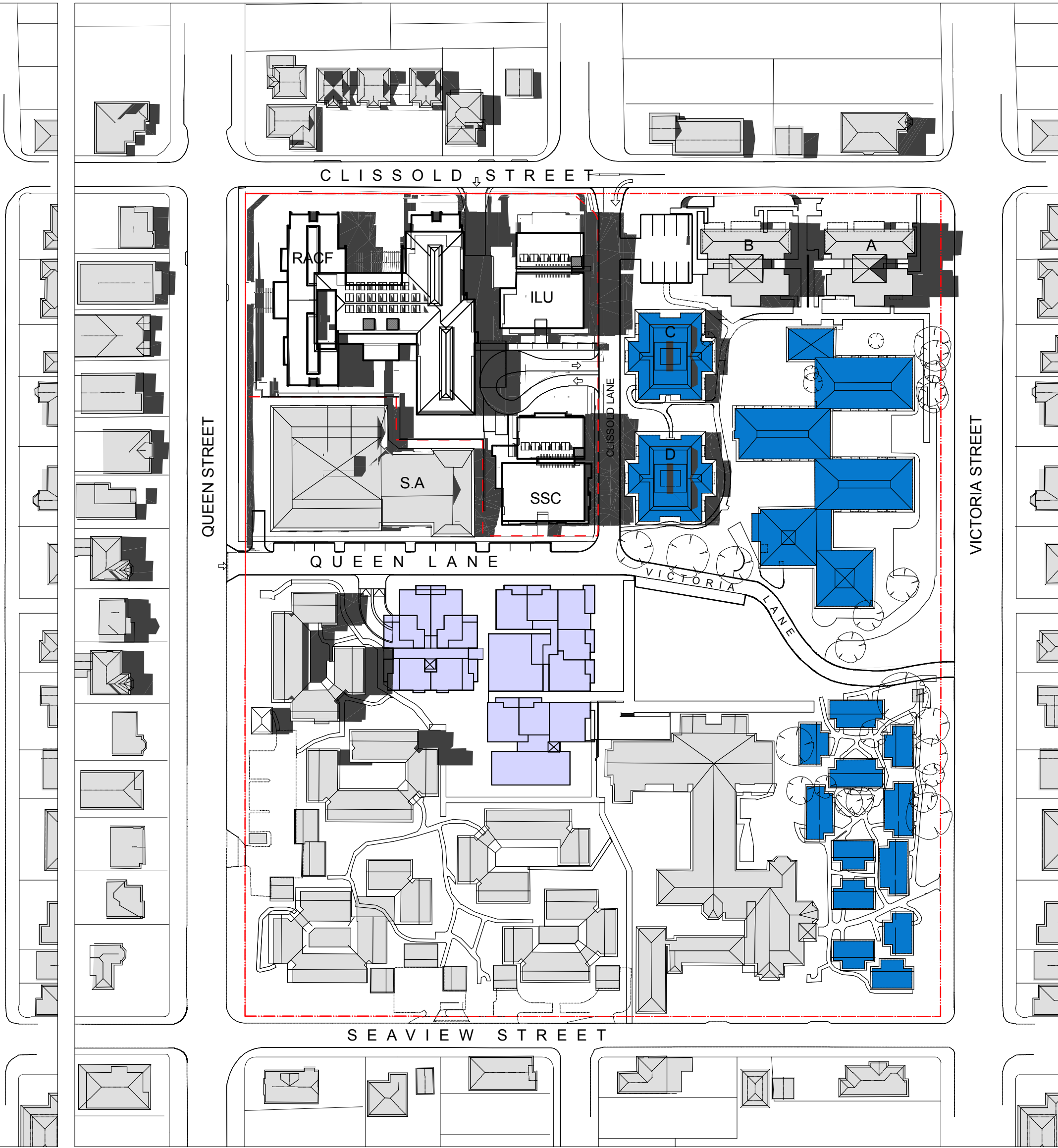
1 21st DECEMBER 3pm SCALE 1:1000 @ A1

© SUTERS ARCHITECTS PTY LTD www.sutersarchitects.com.au ABN 83 129 614 713 Notes The information contained in the document is copyright and may not be used or reproduced for any other project or purpose. Verify all dimensions and levels on site and report any discrepancies prior to the commencement of work. Drawings are to be read in conjunction with all contract documents. Use figured dimensions only. Do not scale from drawings. Suters Architects cannot guarantee the accuracy of content and format for copies of drawings issued electronically. The completion of the issue details checked and authorised section below is confirmation of the status of the drawing. The drawing shall not be used for construction unless endorsed "For Construction" and authorised for issue.