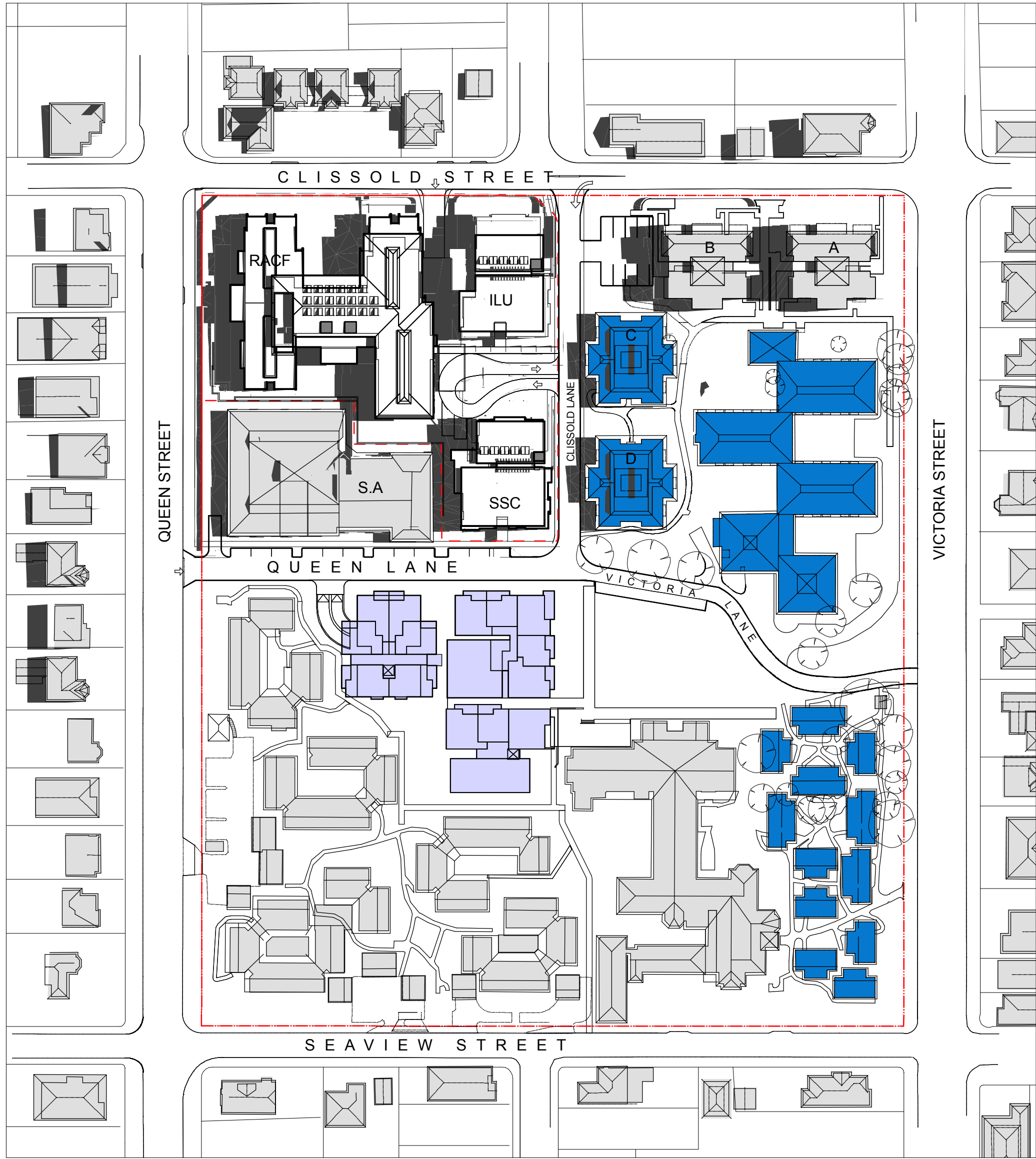
1 21st DECEMBER 9am SCALE 1:1000 @ A1