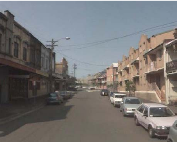
P3. ABERCROMBIE going SOUTH Vehicles use this route likely to travel SOUTH towards Newtown or EAST towards Redfern & Eastern Suburbs.