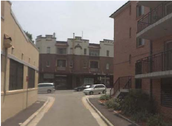
P4. HART intersecting with CLEVELAND No Signage. Vehicles may TURN LEFT ONLY travelling WEST towards City Road and turn right at ABERCROMBIE to travel NORTH towards Harbour