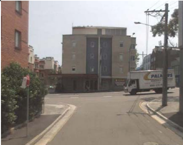
P6. EVELEIGH intersecting with CLEVELAND No Signage. Vehicles may use EVELEIGH street to access Cleveland Street to enable better convenient access into the RIGHT TURN lanes on CLEVELAND street.