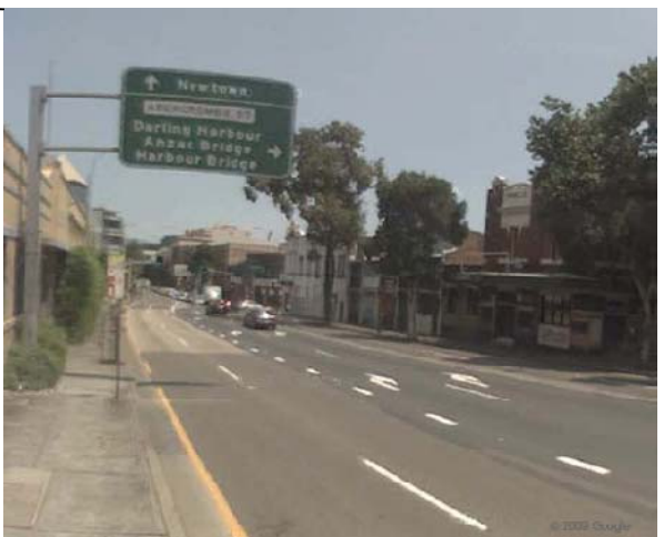
P5. HART intersecting with CLEVELAND View towards WEST.