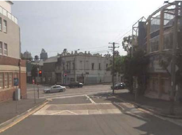
P1. ABERCROMBIE intersecting with CLEVELAND Traffic Lights: Vehicles may only travel left towards City Road on signal. Travelling WEST towards PARRAMATTA RD or SOUTH towards Newtown.