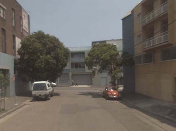
P2. HUDSON intersecting with ABERCROMBIE No Signage: Left turning vehicles may travel SOUTH towards Newtown or EAST towards Redfern bound. Right turning vehicles arrive at the intersection illustrated in P1.