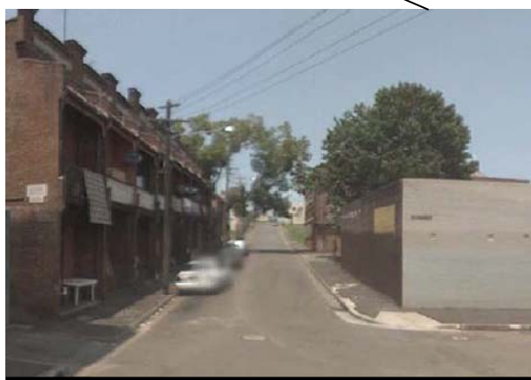
P8. EVELEIGH travelling SOUTH Vehicles may travel SOUTH towards Lawson street to access Redfern and Eastern Suburbs.