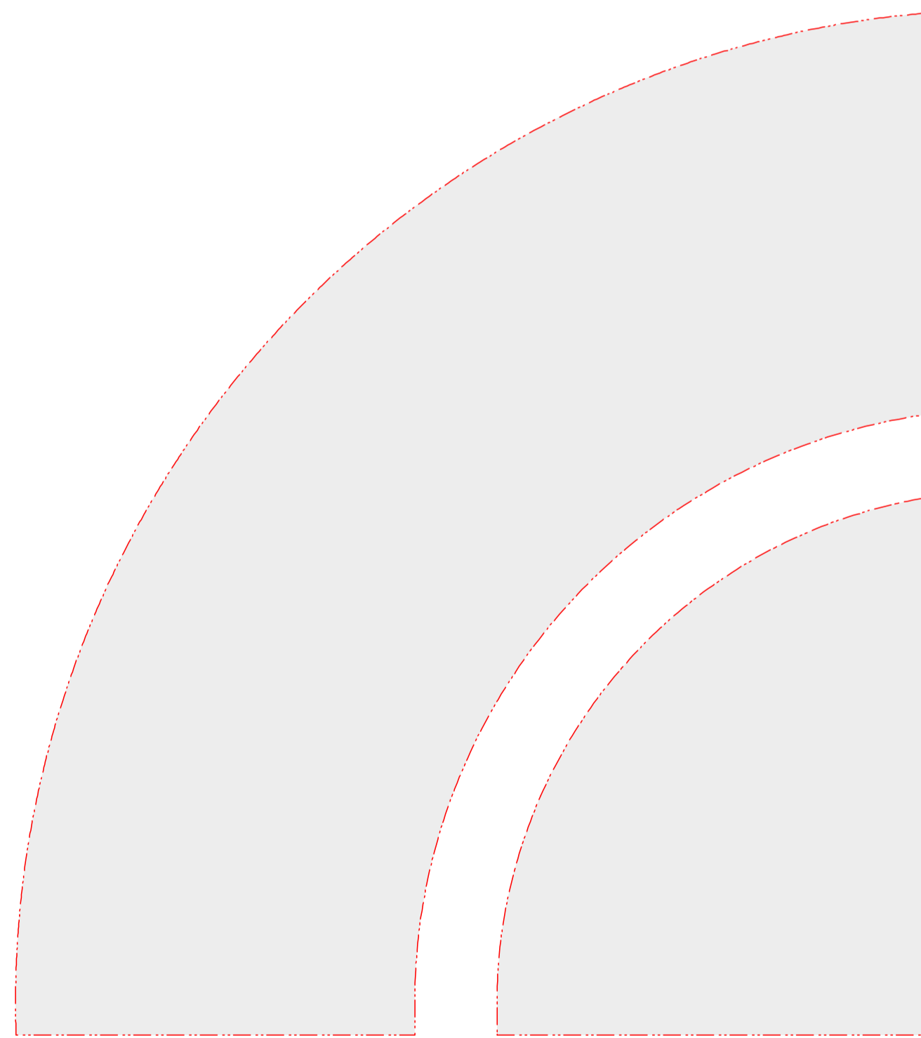
SITE AREA, excluding Amalfi Drive: 23,191sqm