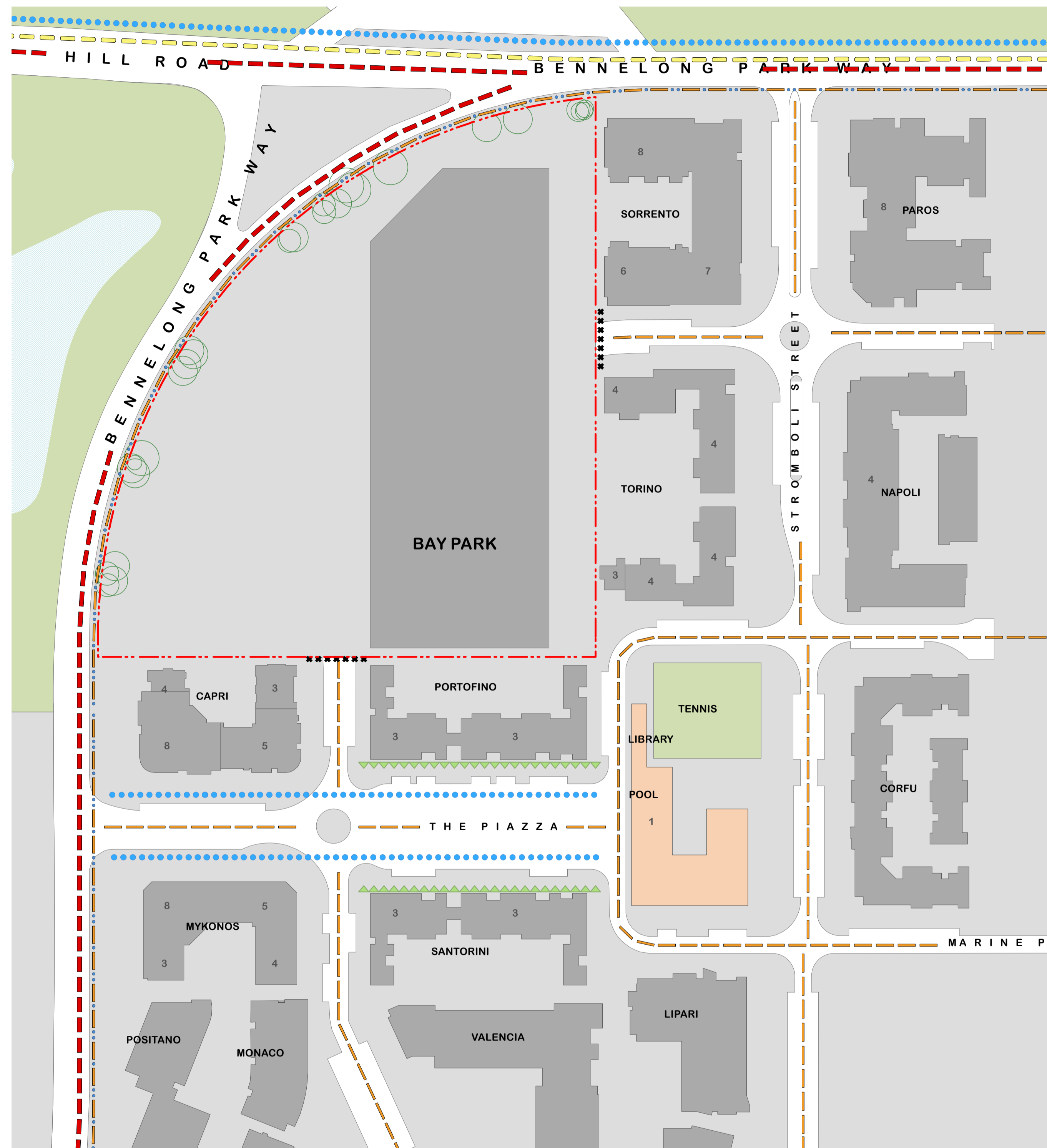
TRAFFIC ANALYSIS DIAGRAM, EXISTING