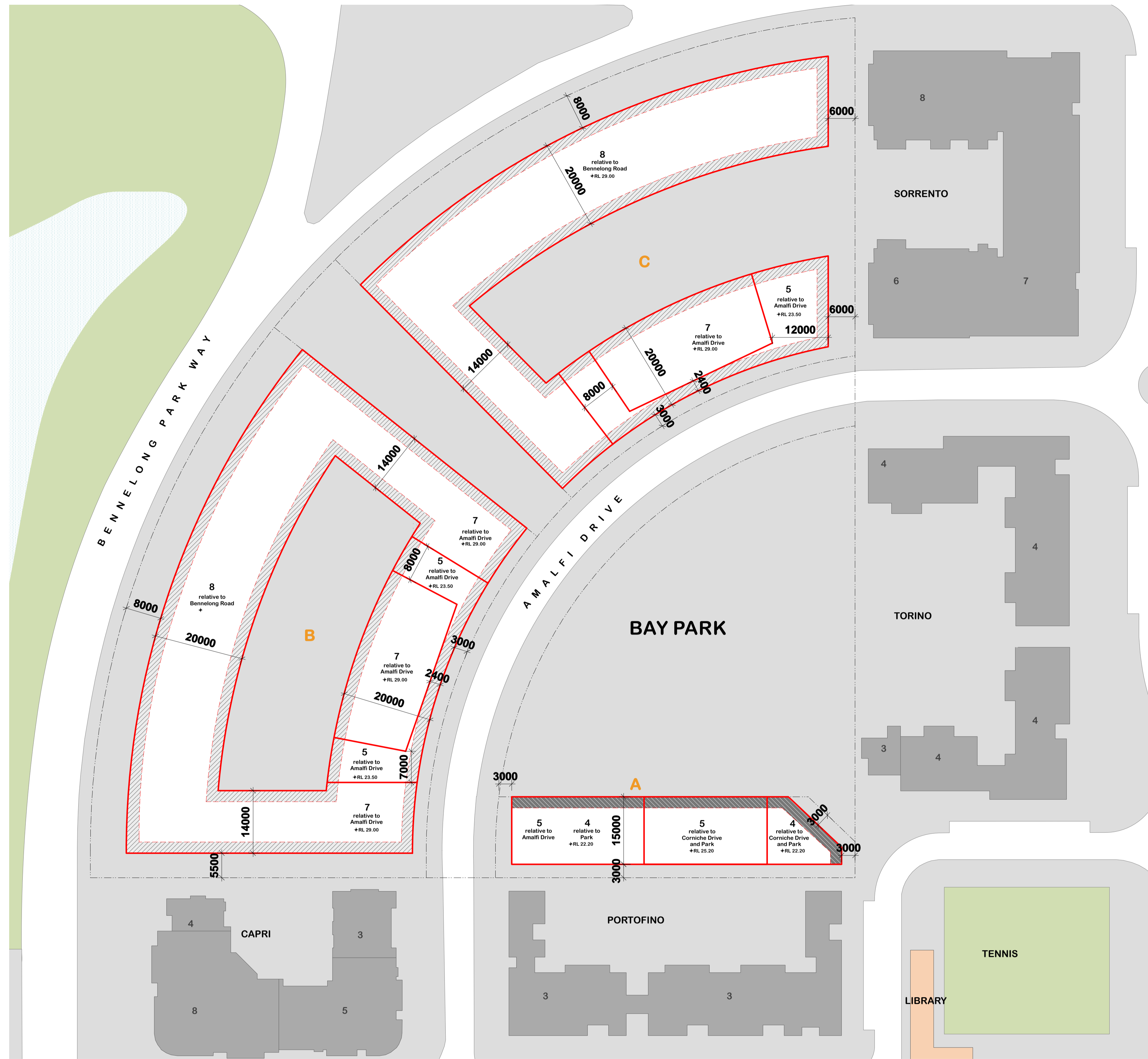
BAY PARK ENVELOPE - PLAN