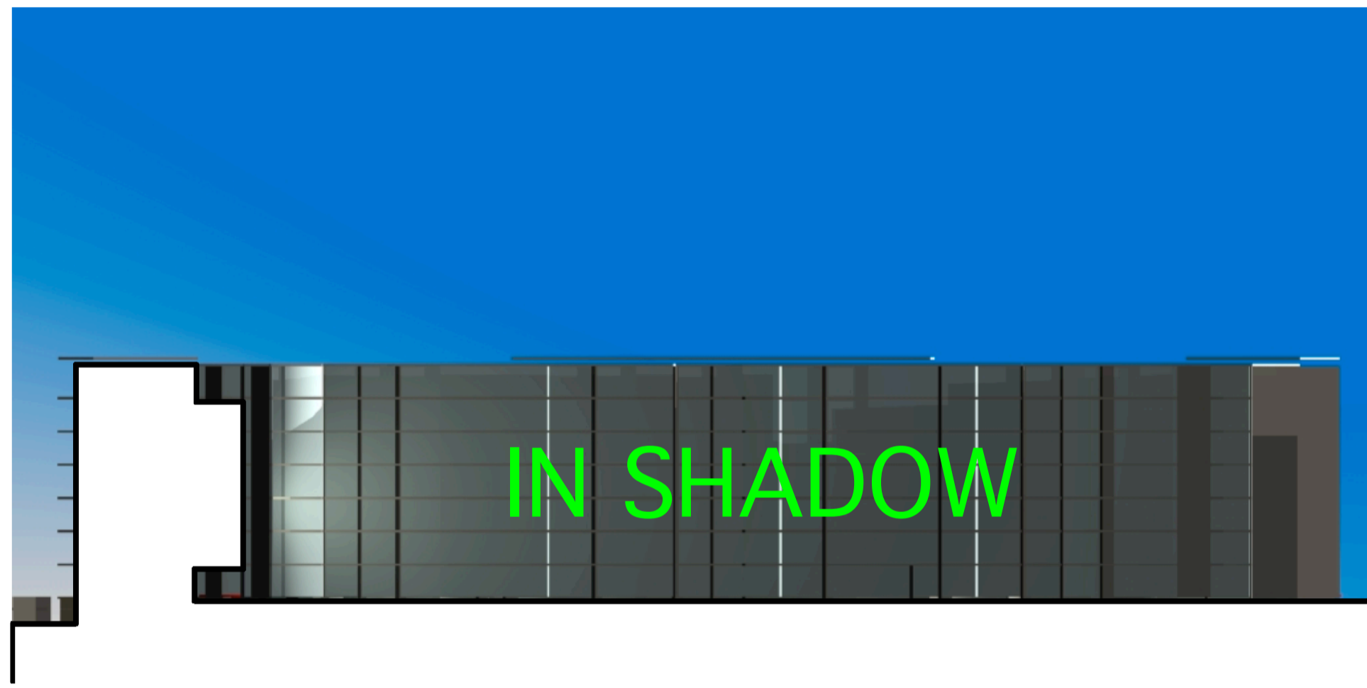
June 21 12am Shadows