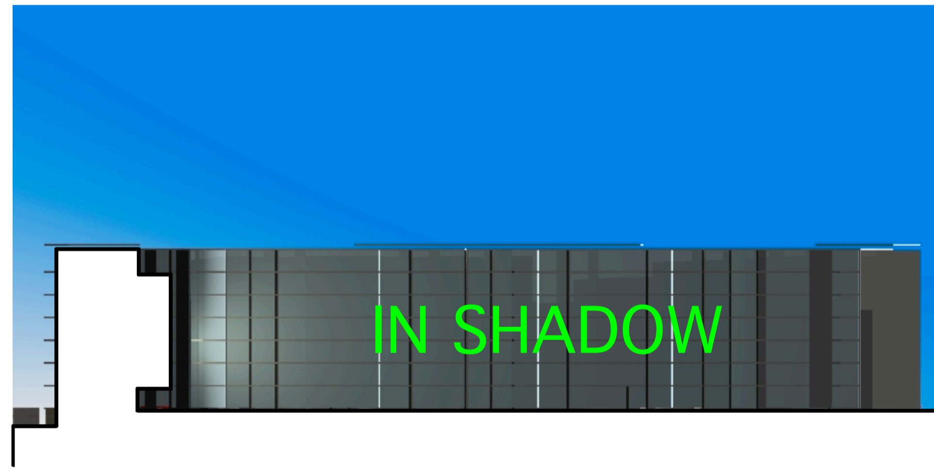
June 21 1pm Shadows