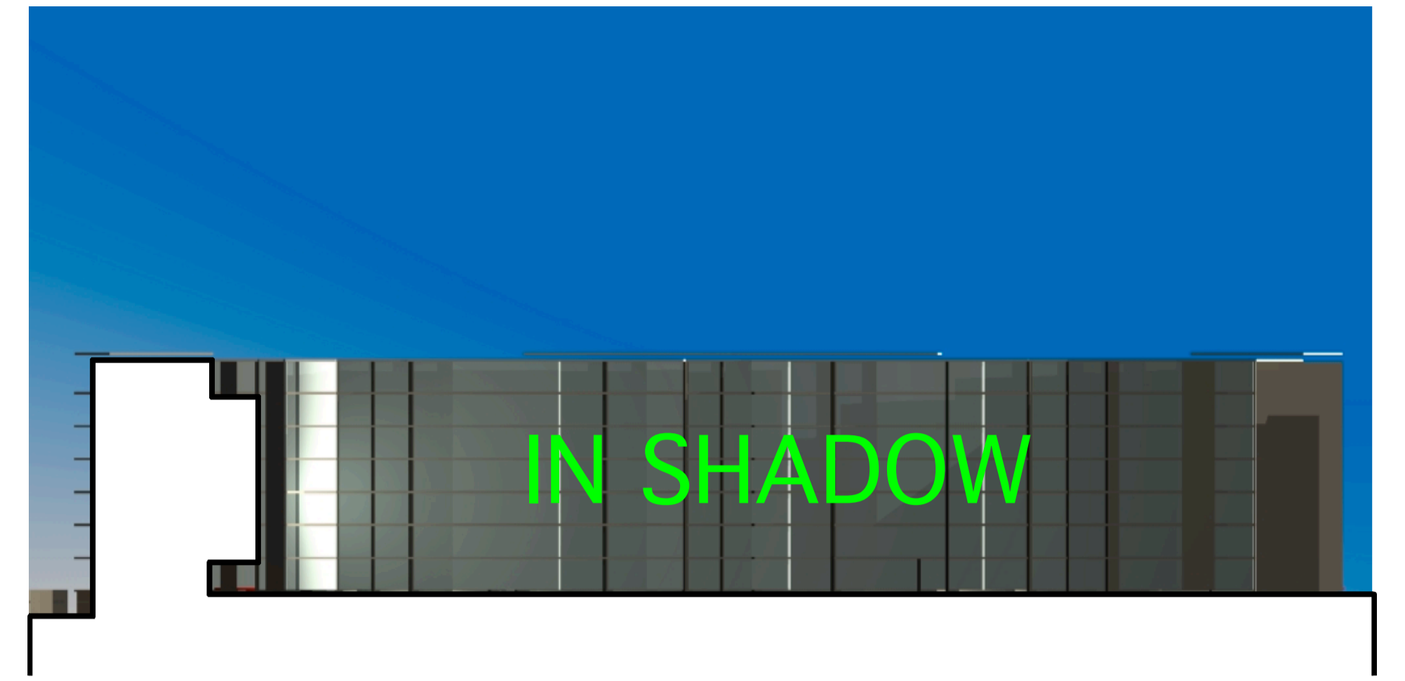
June 21 11am Shadows