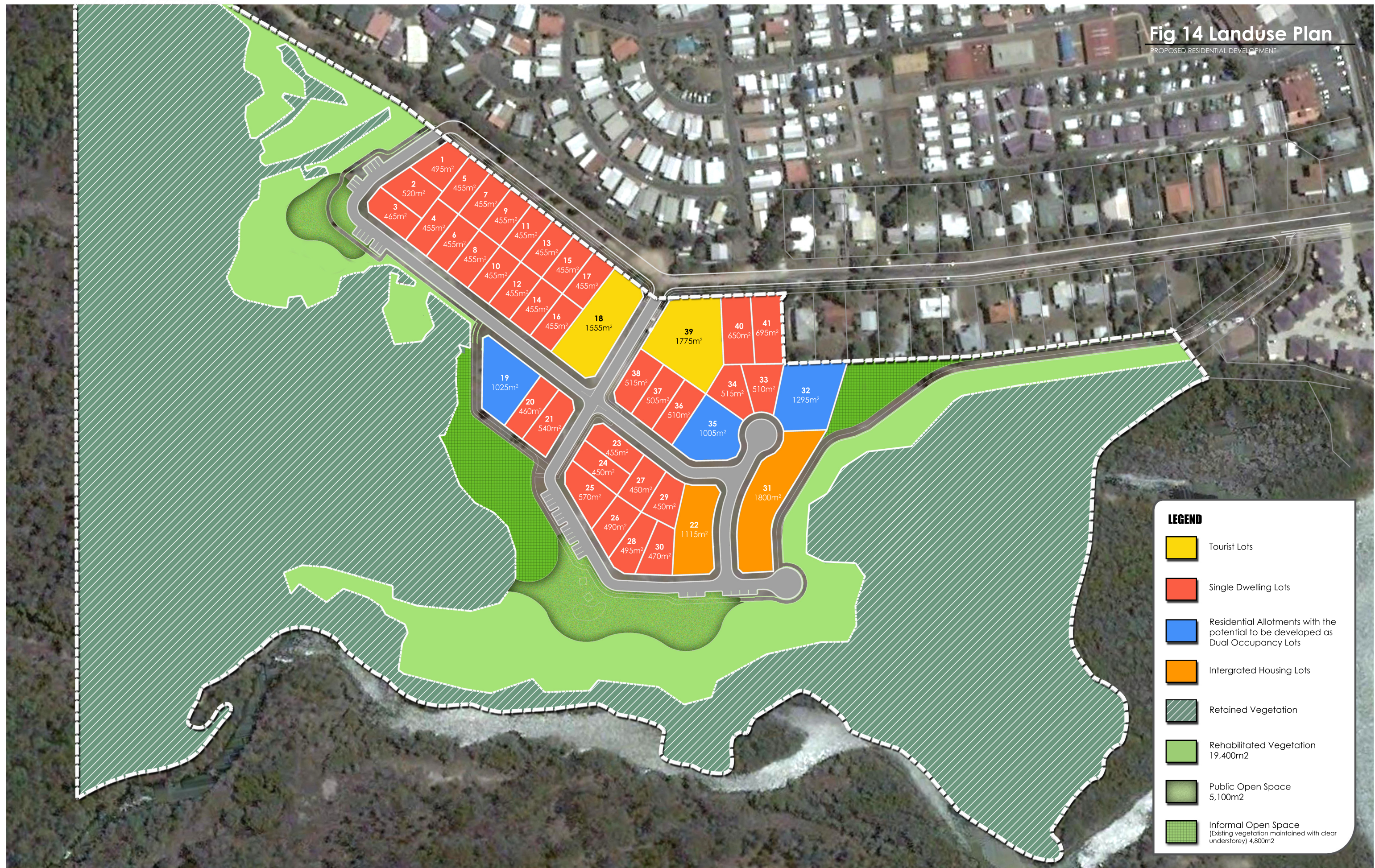
FIGURE 14 Landuse Plan 01

156 Creek Street Hastings Point RESIDENTIAL SUBDIVISION