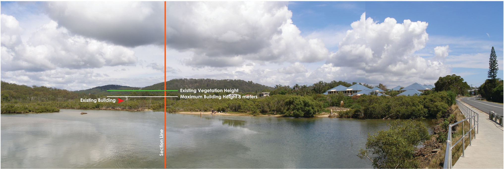
Site Image A Typical Section A