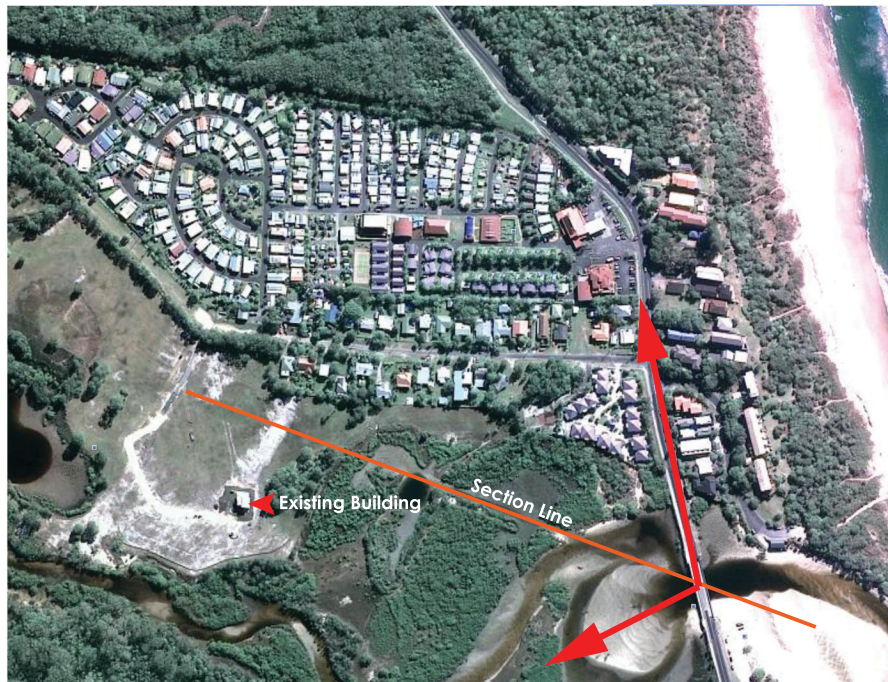
Context Plan Typical Section A

Vantage Point 1 Tweed Coast Rd Bridge Elevation: 3.0m Distance from Building Line: 406.00m