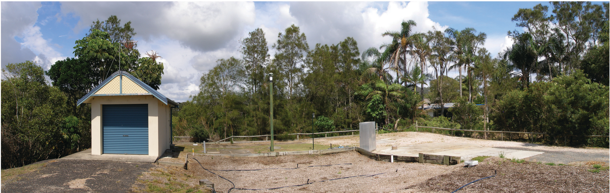
Site Image F ▲