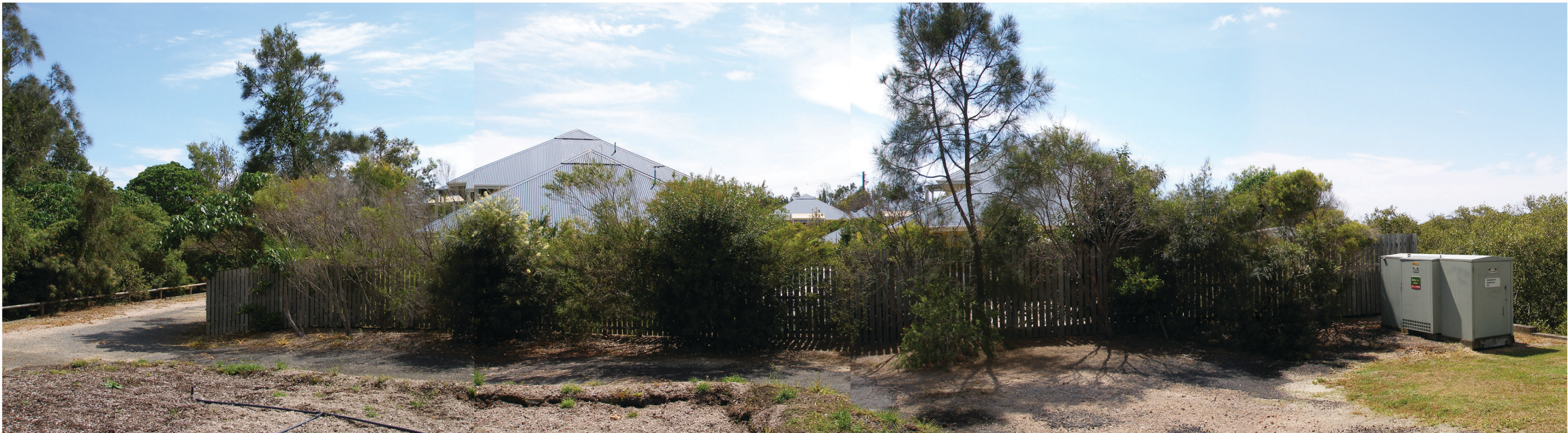
Site Image G ▲

As Shown, existing vegetation to the lot boundary as well as the orientation of buildings themselves limit any views of the site. As illustrated in 'Site Image F' any limited view catchments are further screened by a secondary vegetation stand.