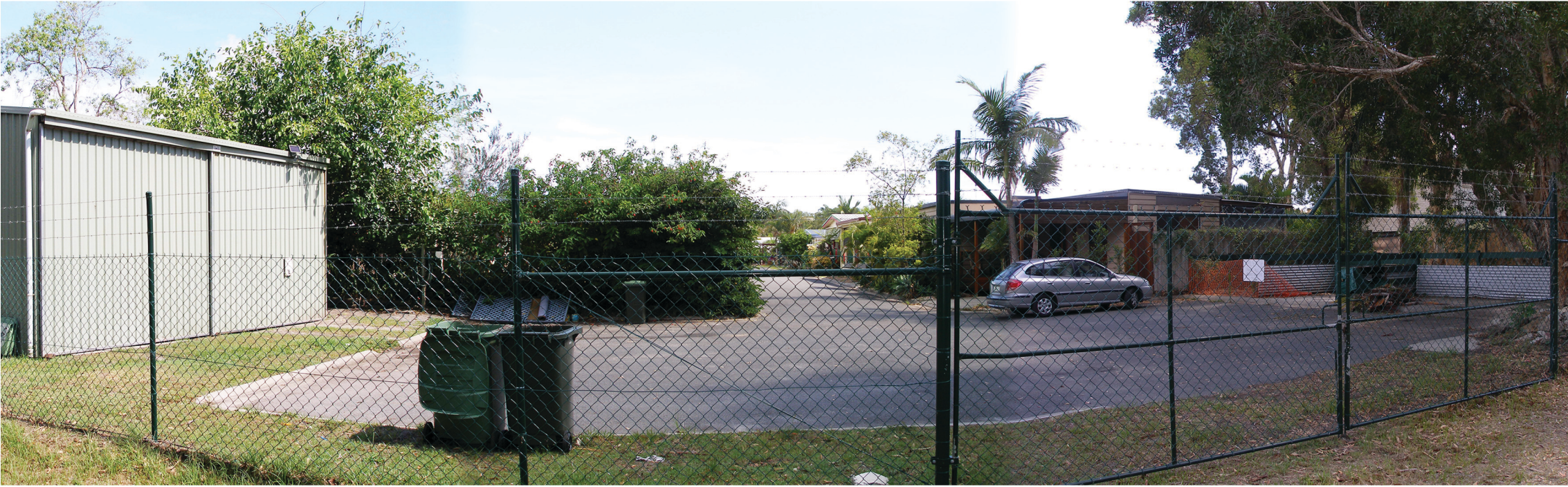
Site Image I ▲

Views into the subject site are screened by an existing vegetation stand to the perimeter of the subject site (refer to Site Image J ).