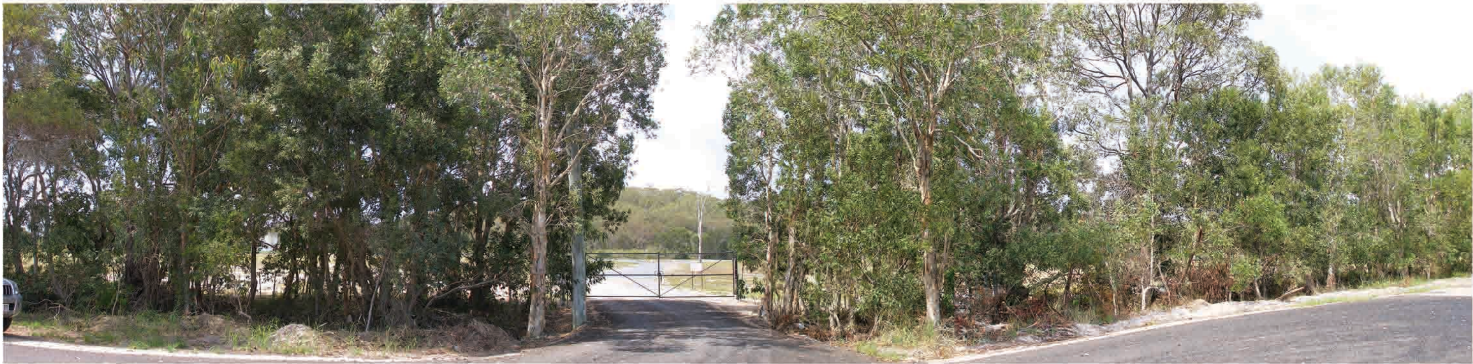
Site Image J