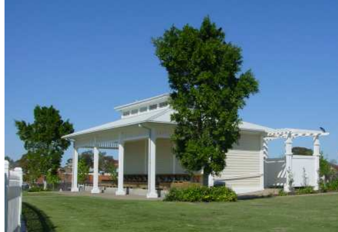
Pavilion overlooking Village Green