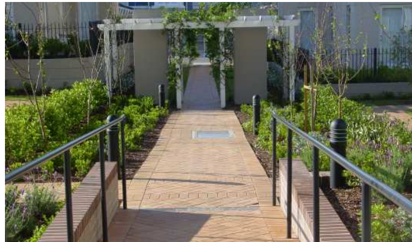
The Orchards Precinct