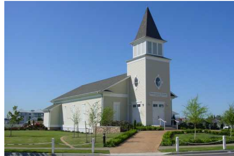
Community Hall, Village Green