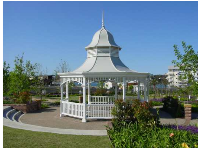
Pavilion at Silkstone Park