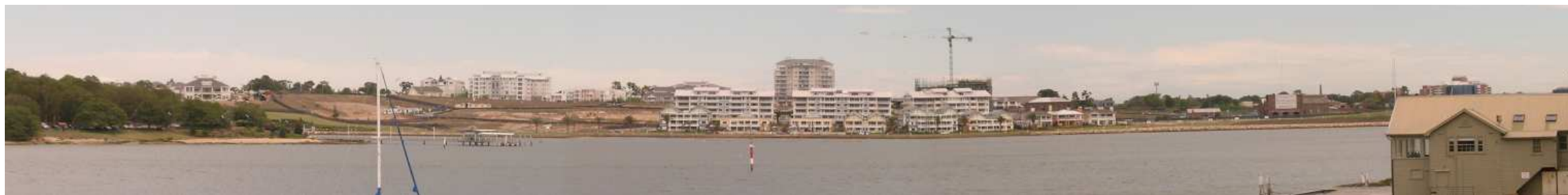
Views to the site October 2005