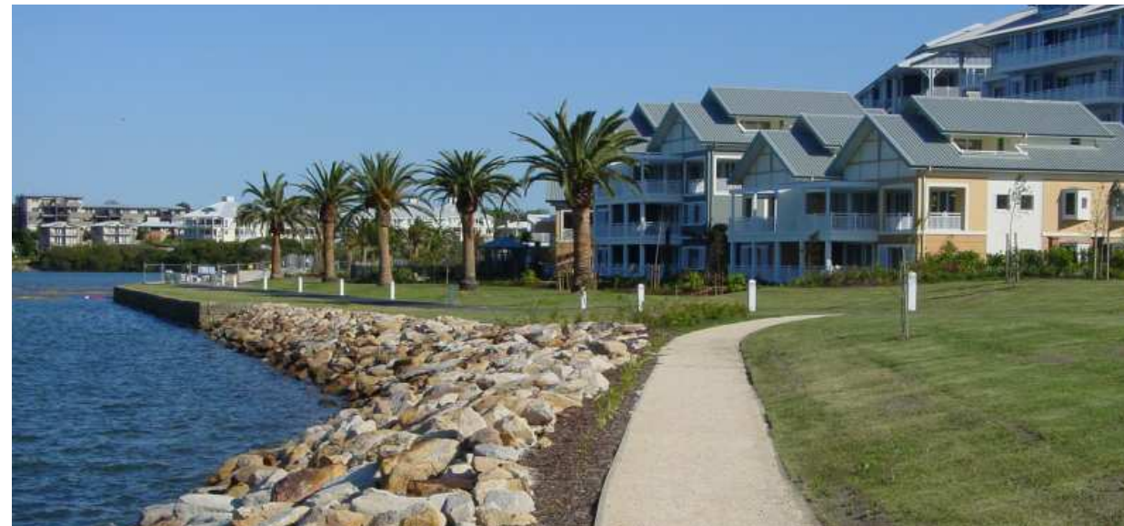
Kendall Bay Waterfront