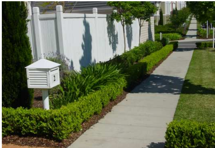
Breakfast Point Boulevard Streetscape