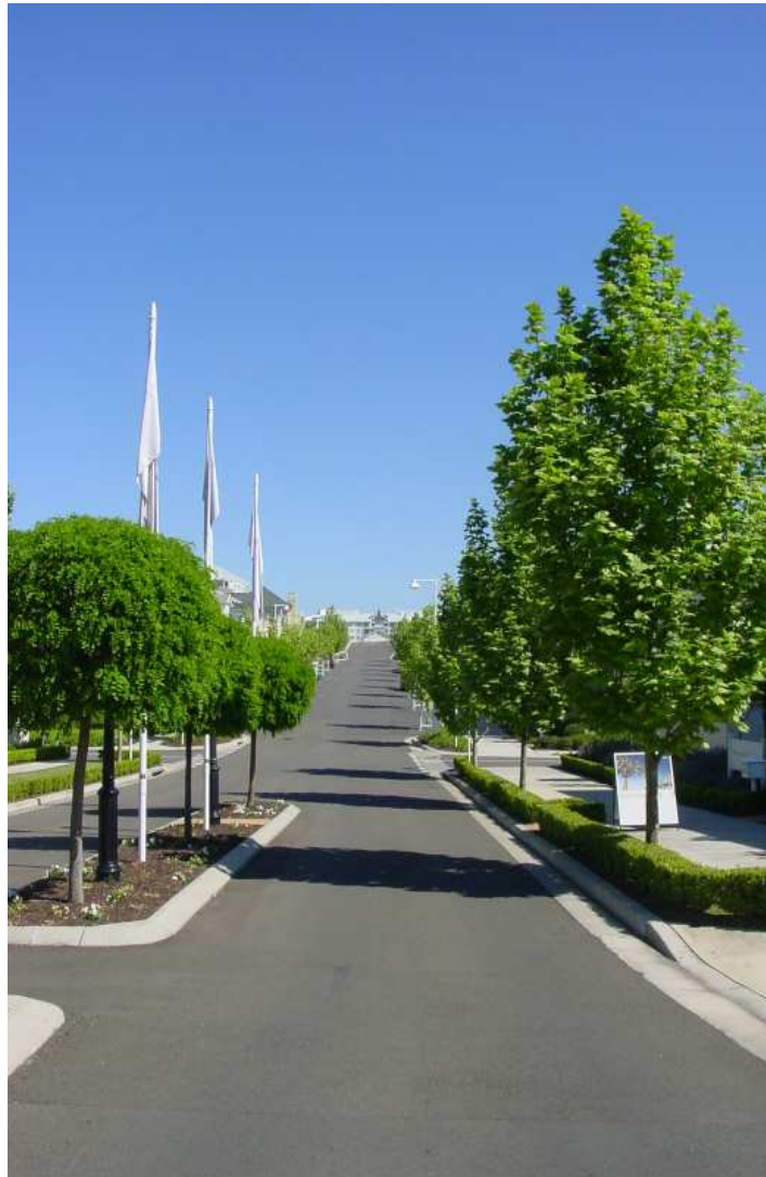
Breakfast Point Boulevard