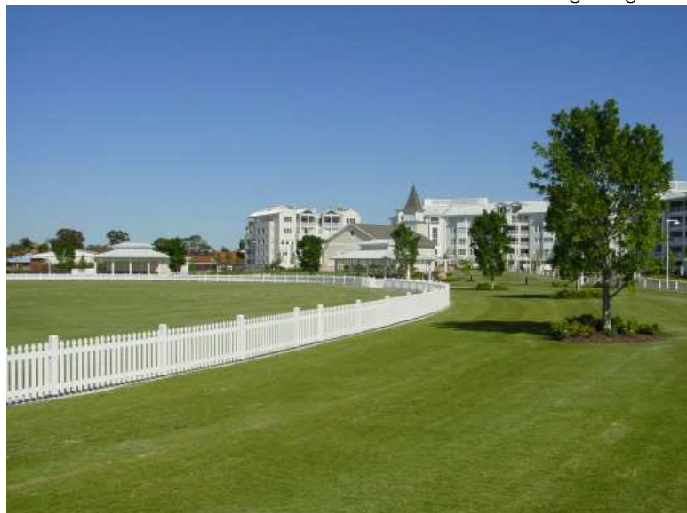
The Village Green