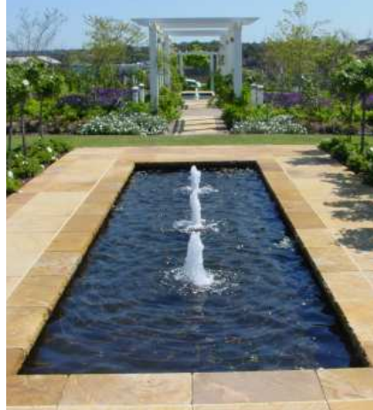
Silkstone Park Fountain