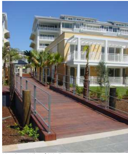
Hunters Wharf Walkway

This intimate landscaped space has been completed as part of the Village Centre.