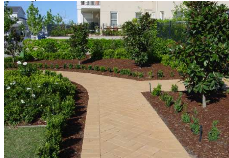
Orchards Avenue Streetscape