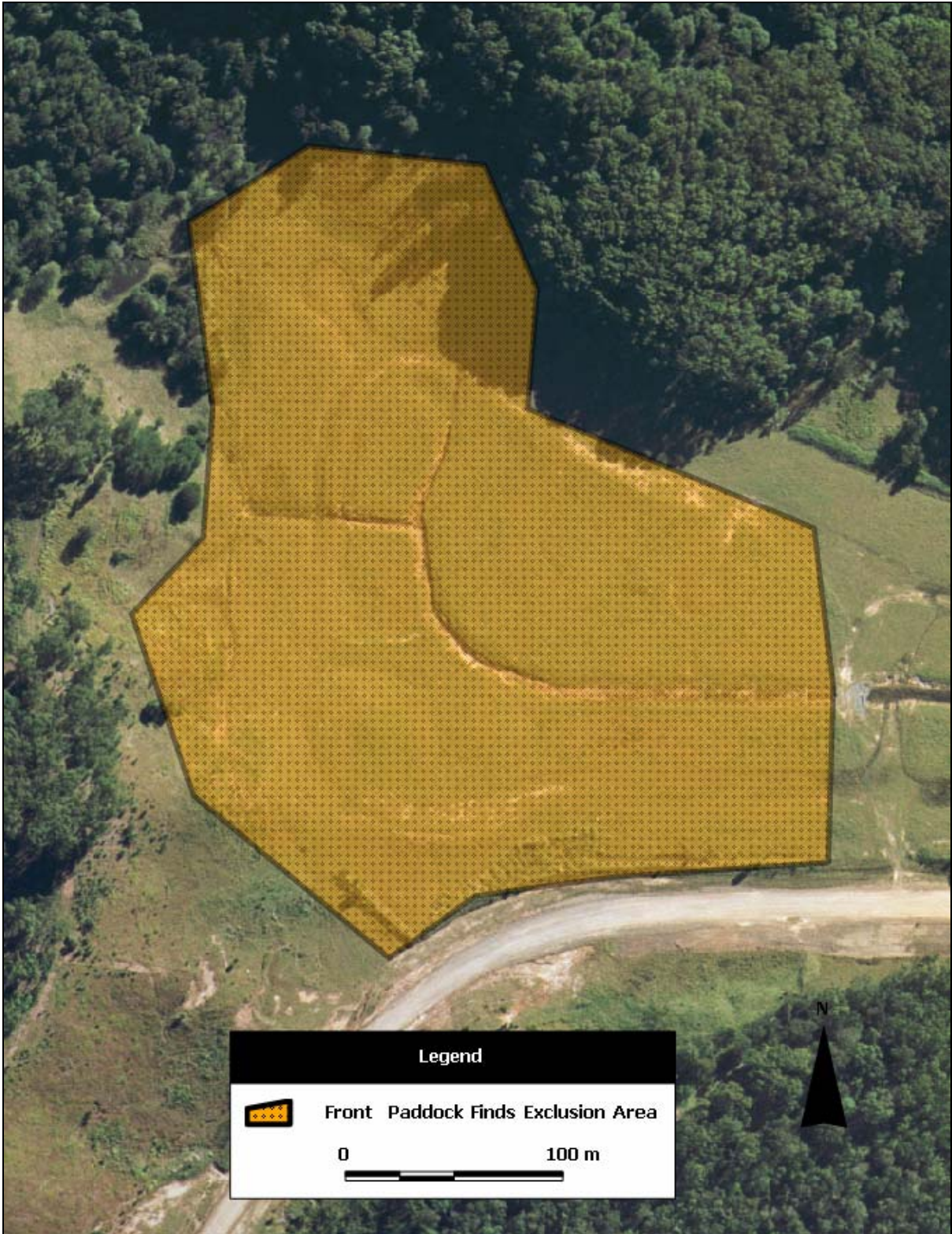
Figure 3: Front Paddock Finds Exclusion Area