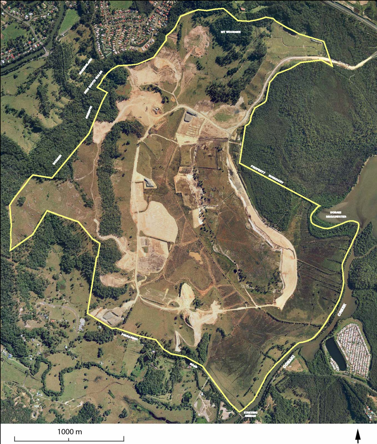
Figure 1: Development Area