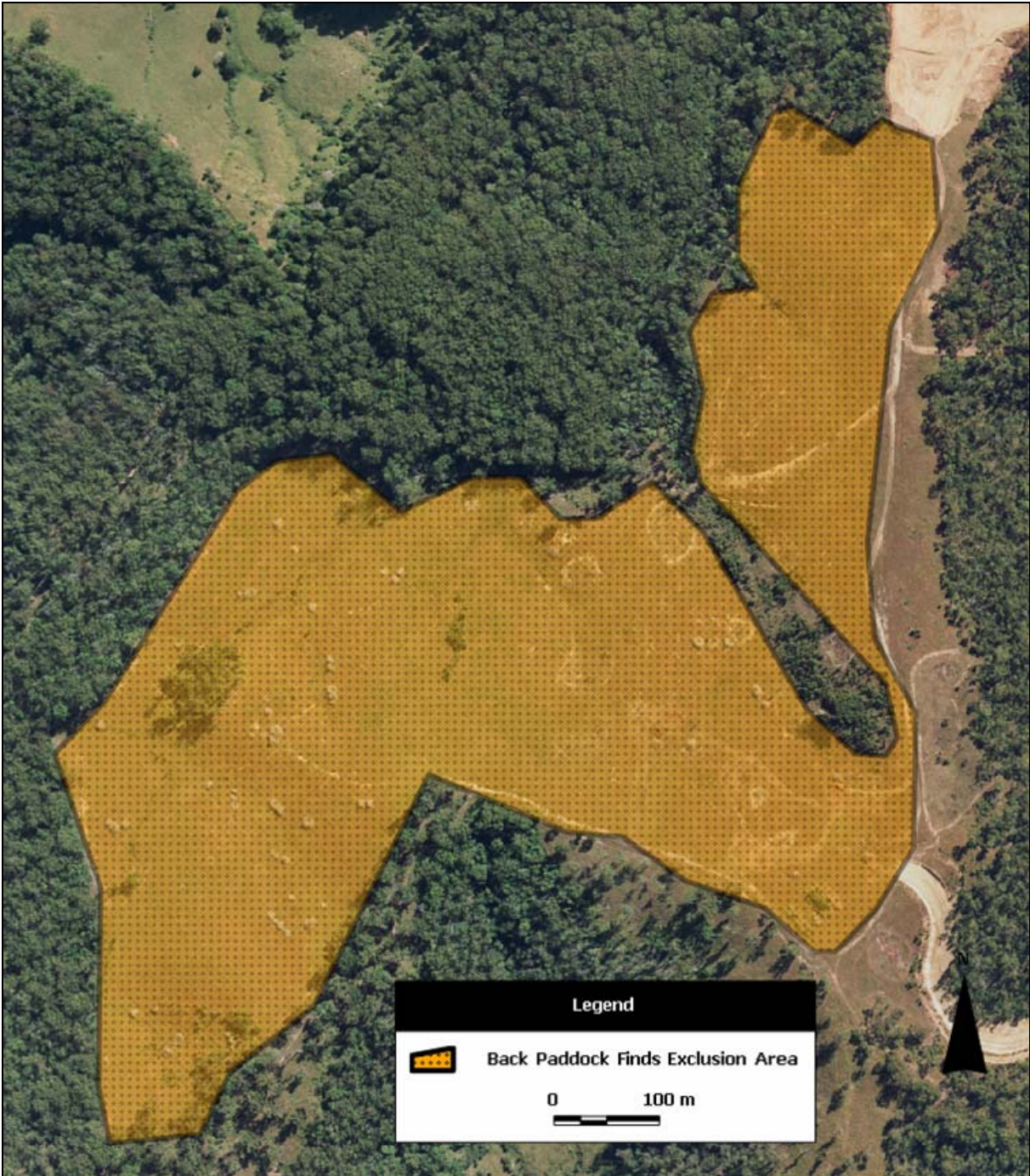
Figure 4: Back Paddock Finds Exclusion Area