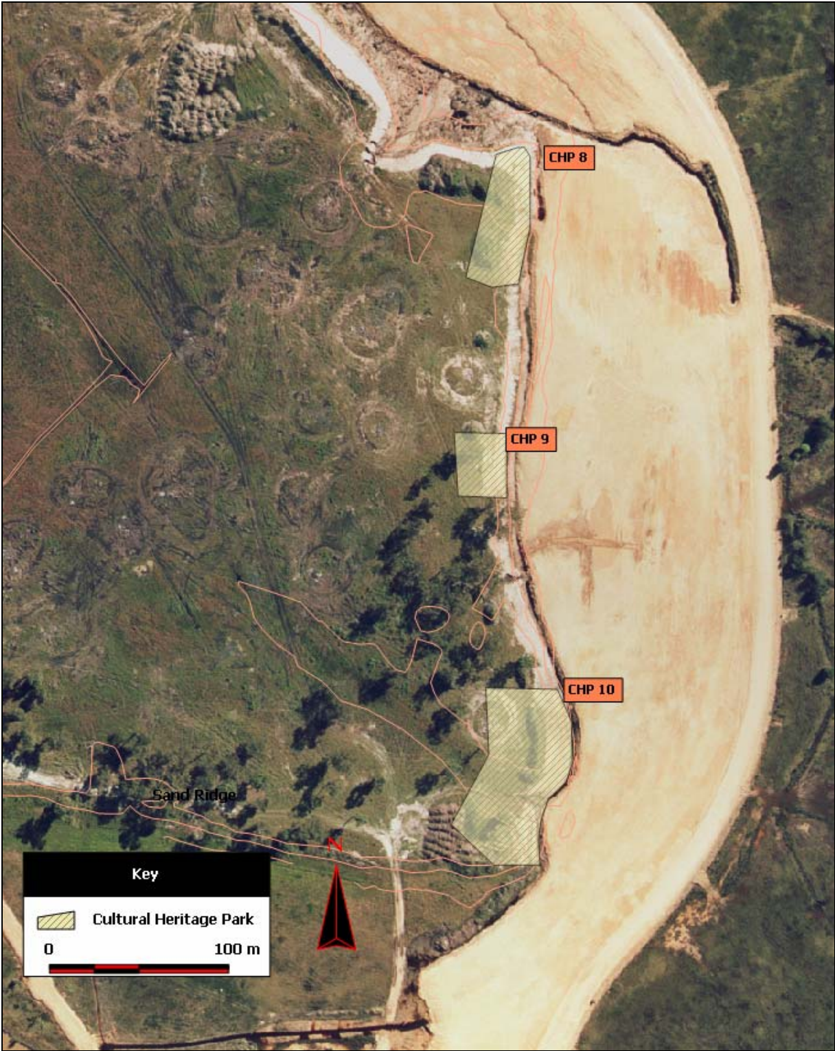
Figure 6: Sand Ridge Cultural Heritage Parks