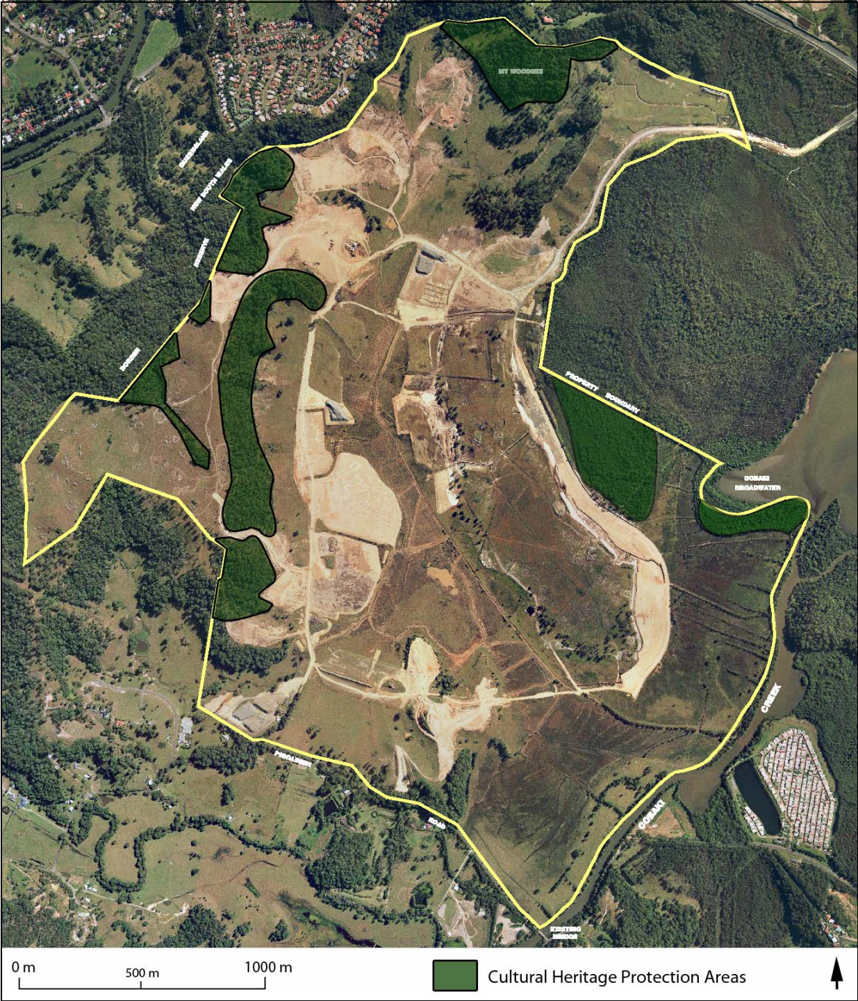
Figure 7: Cultural Heritage Protection Areas