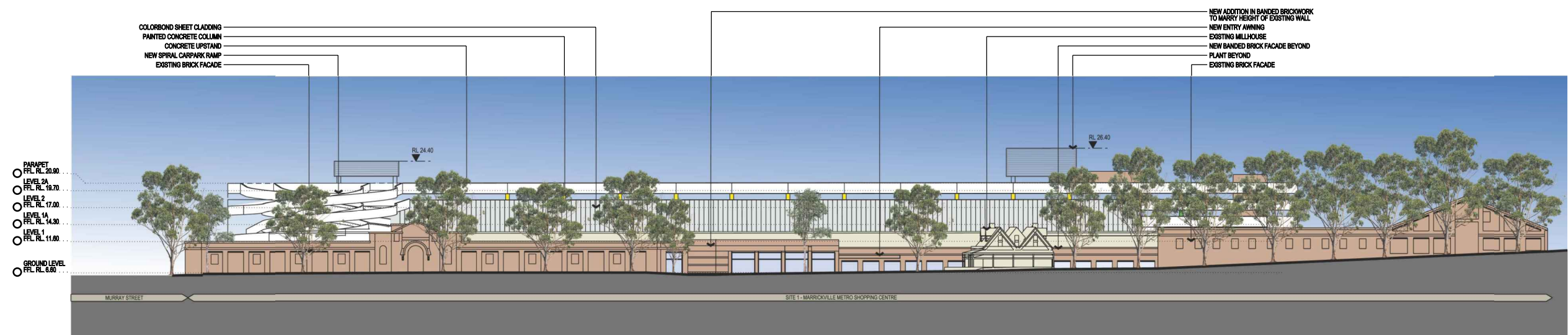
PROPOSED NORTH ELEVATION - VICTORIA RD

*TREES NOT SHOWN FOR CLARITY. REFER TO LANDSCAPE DRAWINGS FOR DETAILS.