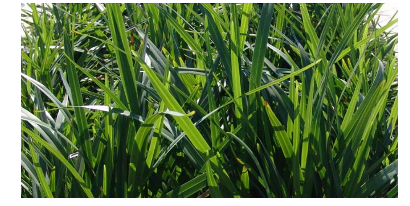
Dianella caerulea 'Breeze'