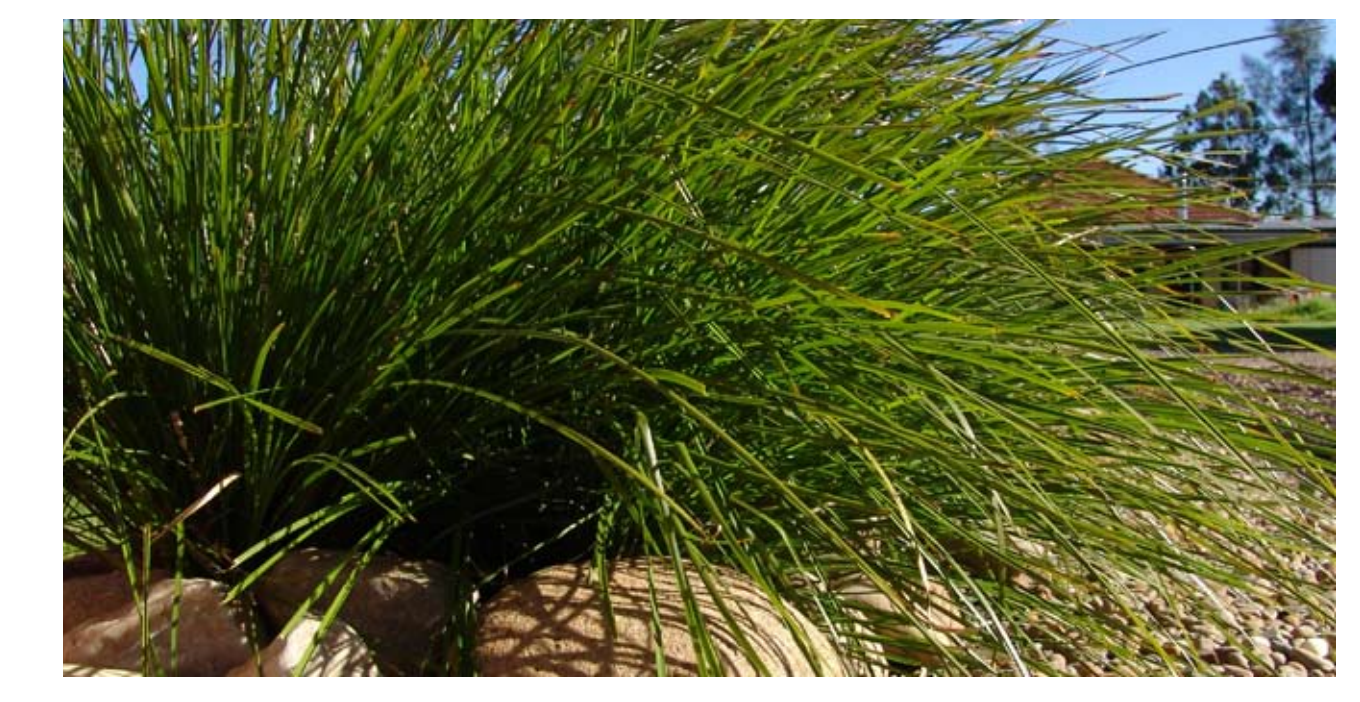
Lomandra longifolia 'Tanika'