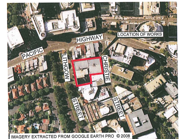
LOCALITY PLAN NTS