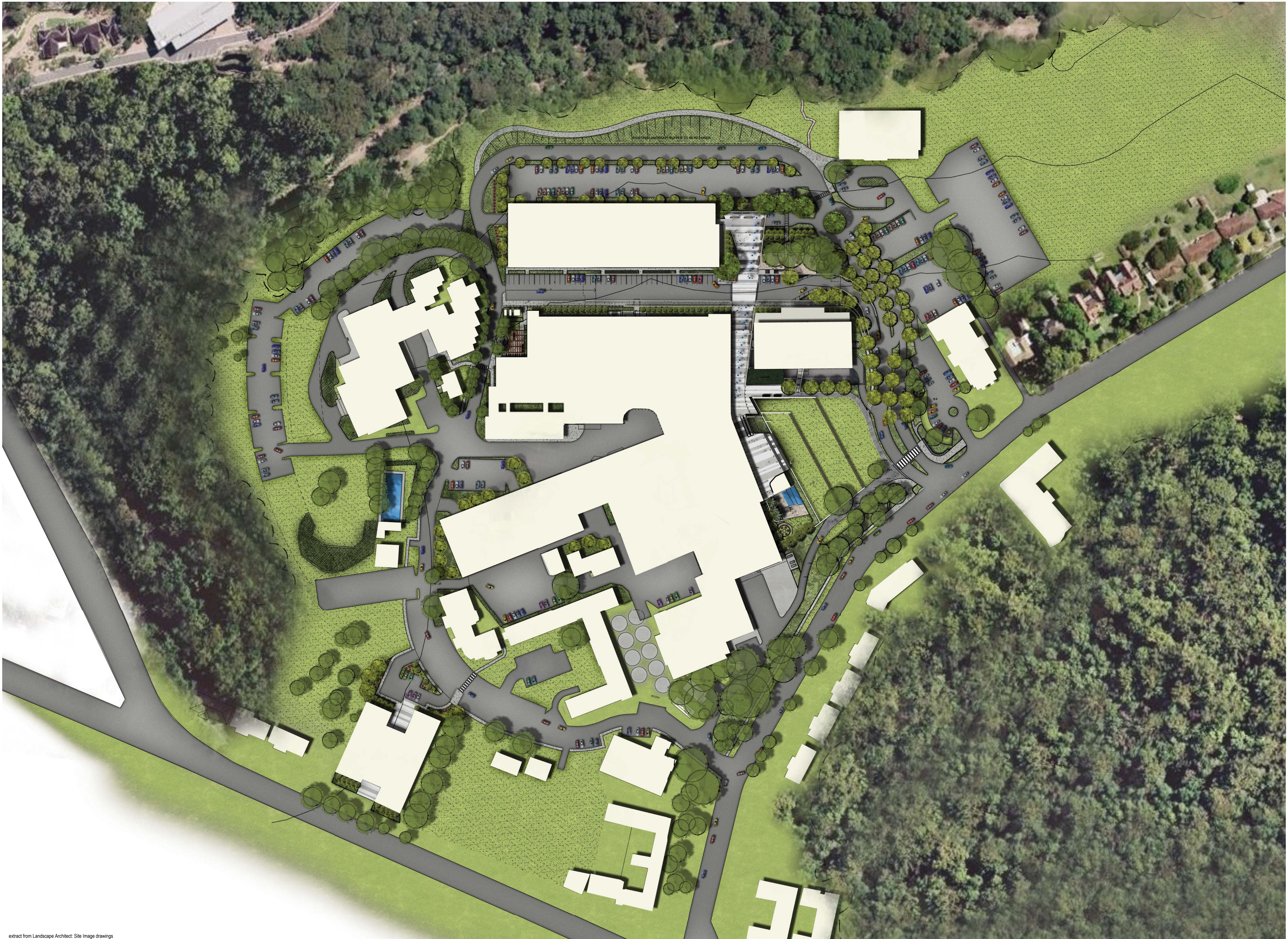
extract from Landscape Architect: Site Image drawings