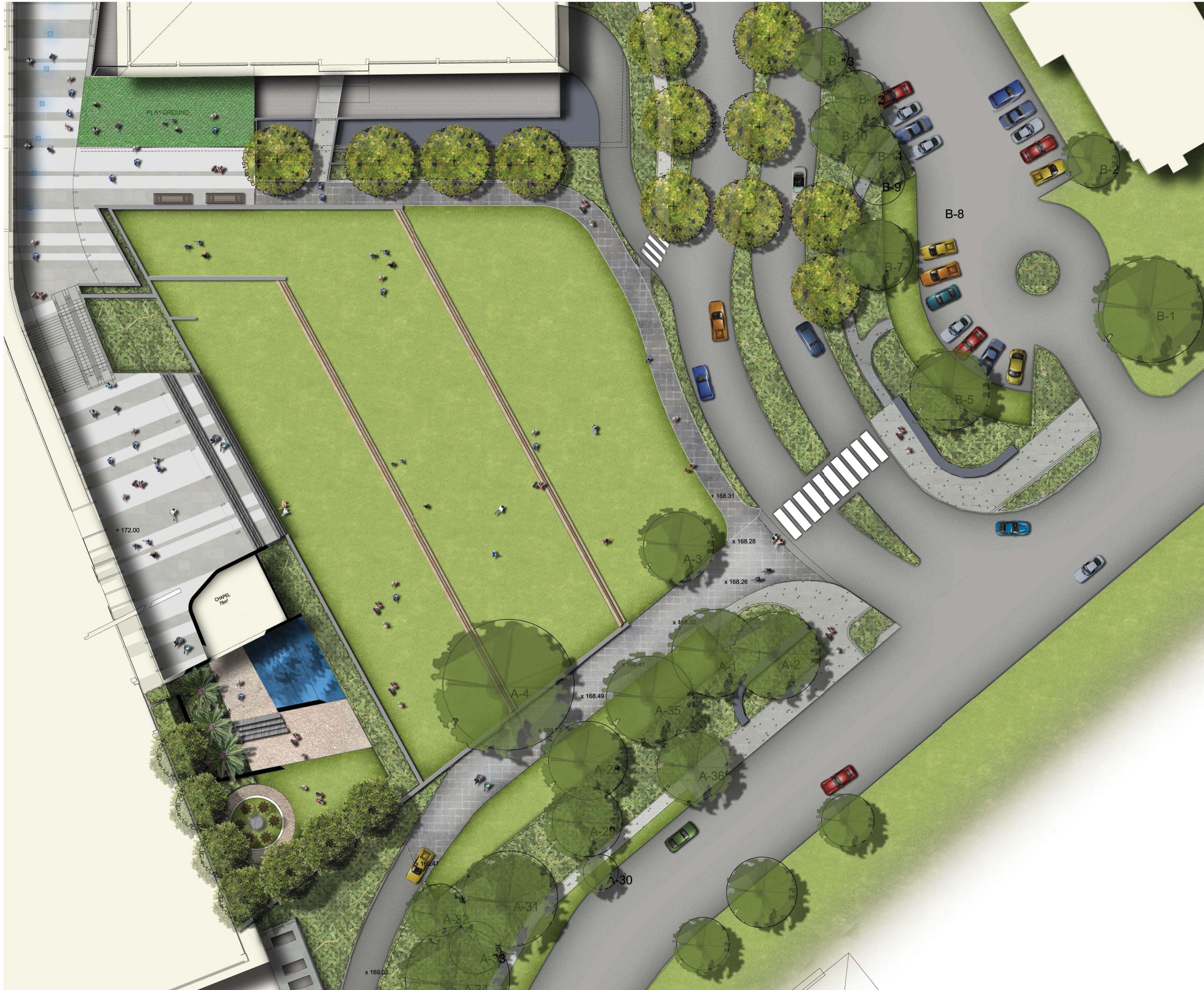
Part 3A Application Landscape Design Proposals Scale 1:250 @ A1