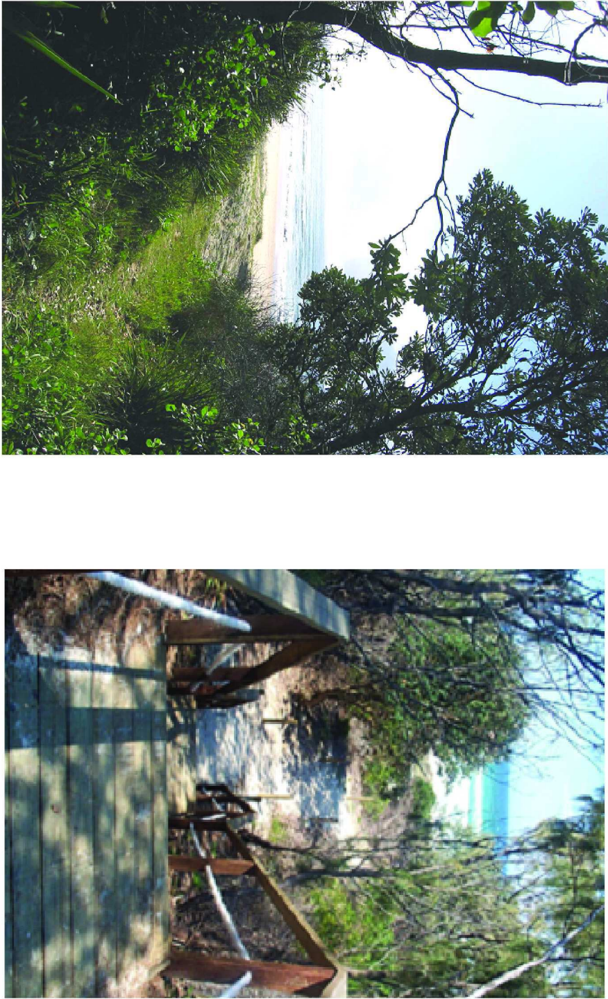
EXISTING BEACH ACCESS