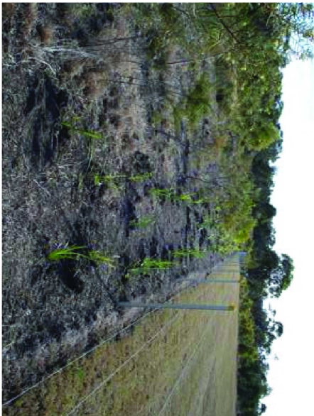
Central Corridor on left