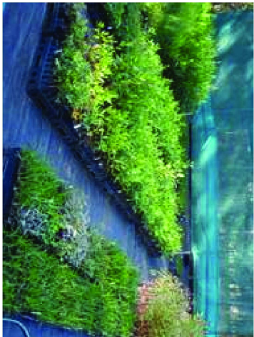
A NURSERY WAS ESTABLISHED ON SITE TO GROW THOUSANDS OF PLANTS PROPAGATED FROM SEEDS COLLECTED ON SITE