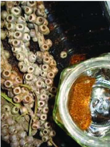
SEED COLLECTION FROM PLANTS ON SITE ASSISTS IN THE ESTABLISHMENT OF SUITABLE NATIVE PLANTS