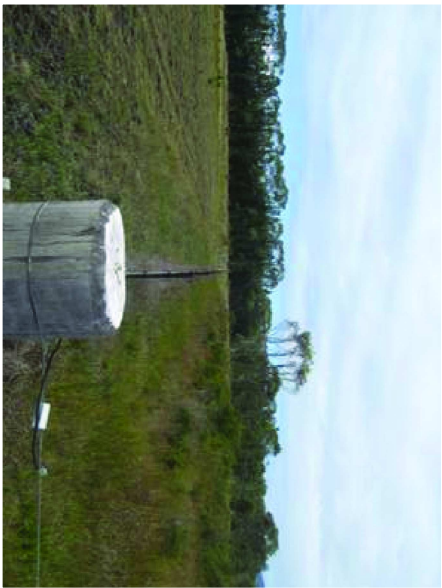
Central corridor on the right