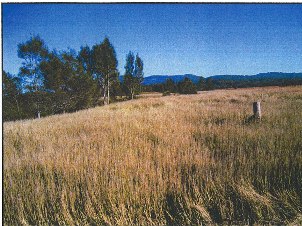
Plate 5. Southern extension area. Typical low visibility on alluvial plains.