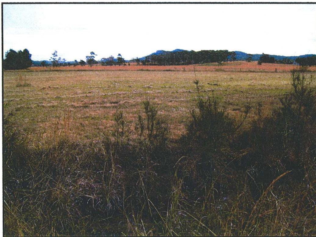
Plate 3. Site 6 (#30-6-111). View west from drain across alluvial plains.