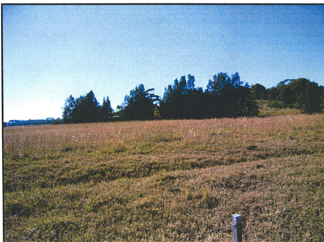
Plate 6. Southern extension area. View east to low bedrock knoll (Site 12 located within oaks in middle distance).