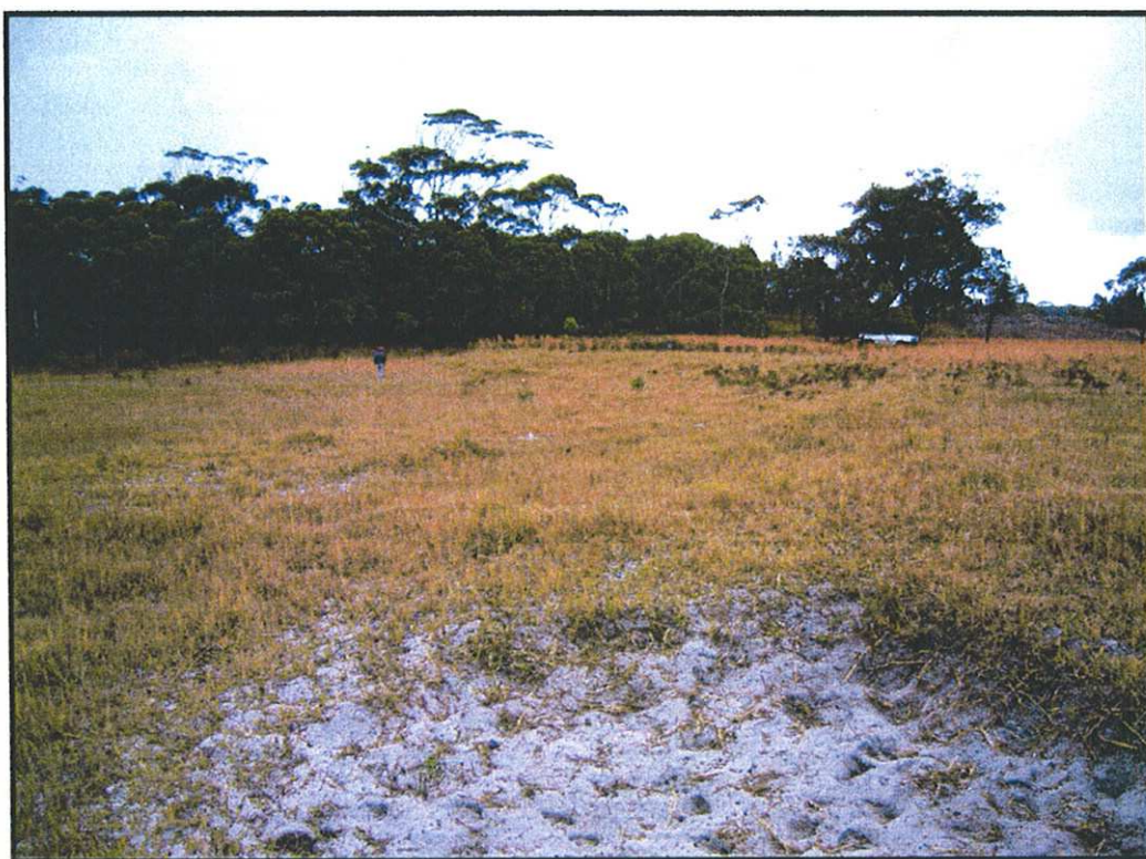
Plate 2. Site 4 (#30-6-109). View south across the regenerating and now reasonably well-stabilised 'location 2' quarry cutting.