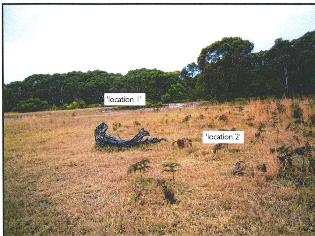
Plate 1. Site 4 (#30-6-109). View east from 'location 2', across gravelled road to sand exposure at 'location 1'.