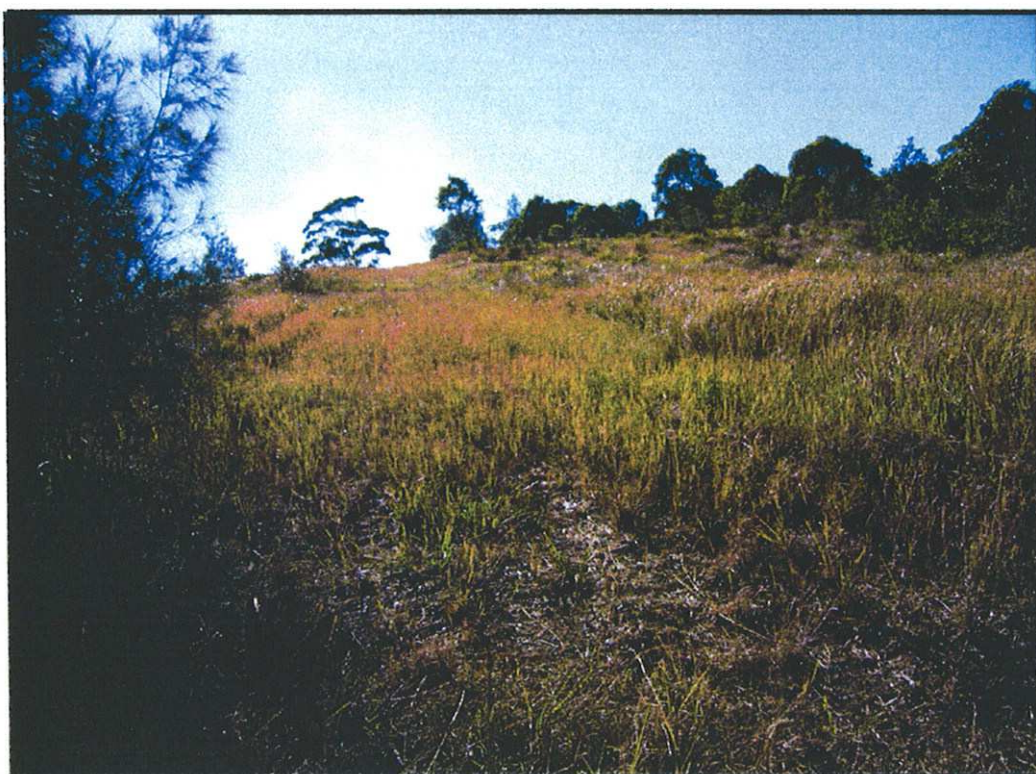
Plate 8. Southern extension area. Existing downcut track on knoll south of the Site 12 artefact scatter. Recommended knoll access route.