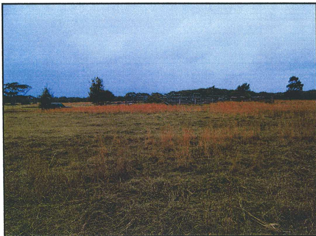
Plate 4. Site 10 (#30-6-115). View south-east across former sand exposure.