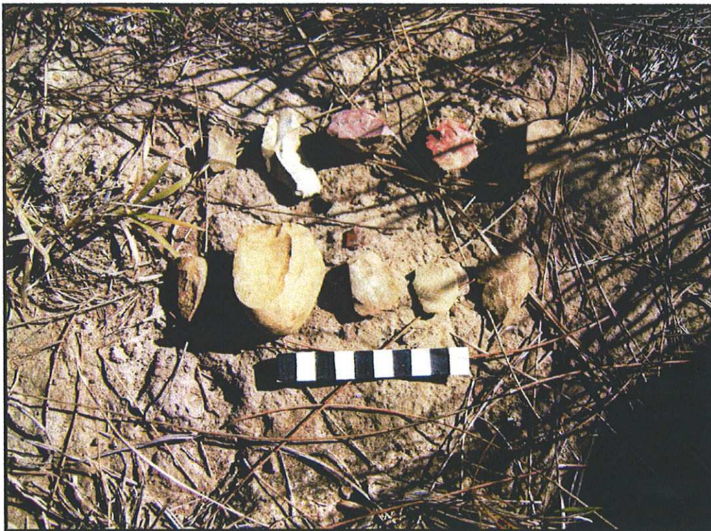
Plate 7. Example of Site 12 artefacts, on eroded knoll footslope.