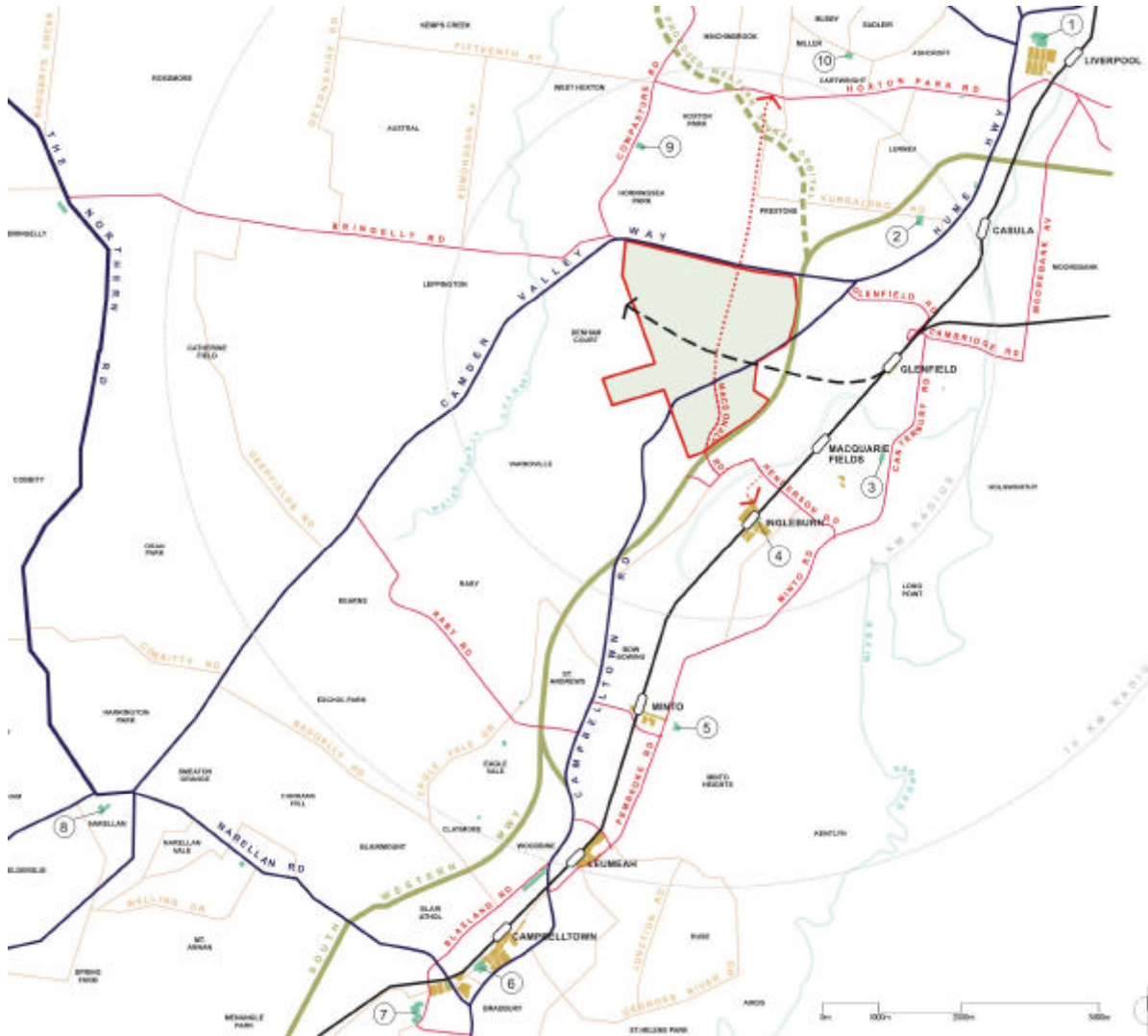
Figure 1 – Centres & Regional Structure