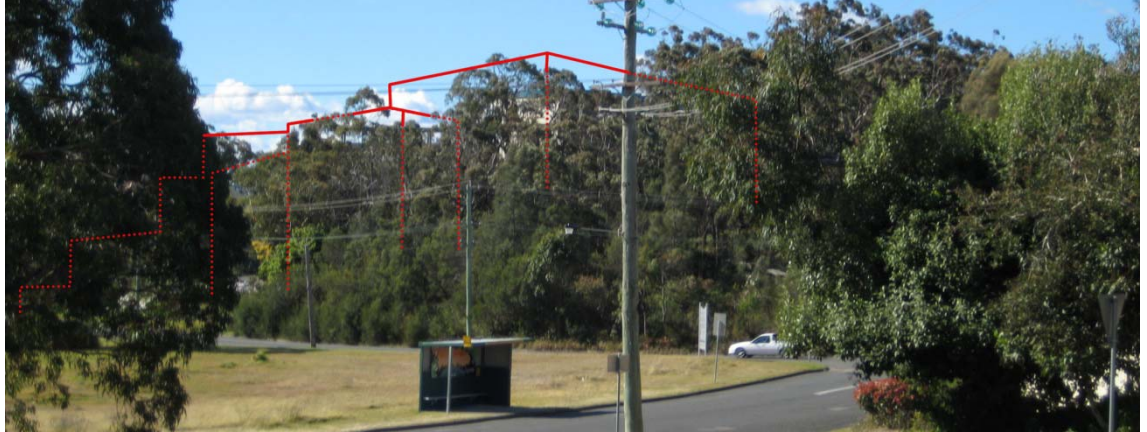
View D North East from Bagnall Road (South)

Similarly to View A, views to the proposed development from this location will be almost entirely screened from view by the existing vegetation on the reserve to the south. It will have minimal impact on views from the neighbouring residential development