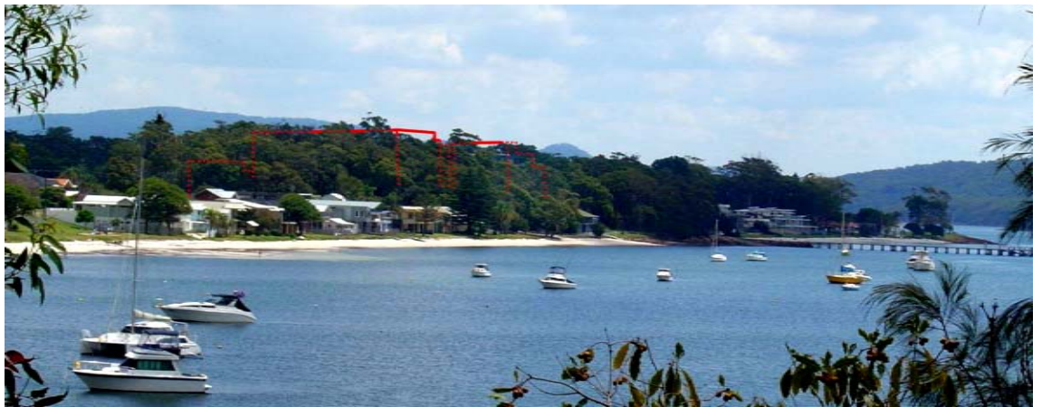
View A from Wanda Headland

The existing vegetation on the natural reserve almost entirely screens the proposed development from view from this location. Small portions of the residential and serviced apartment blocks will be visible. The visual impact will be similar to that presented by existing resort.