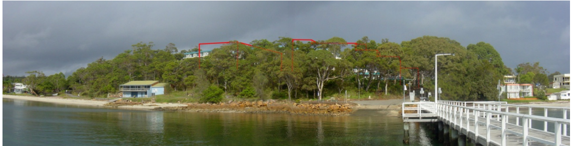
View E from the jetty facing west (refer to View B above)