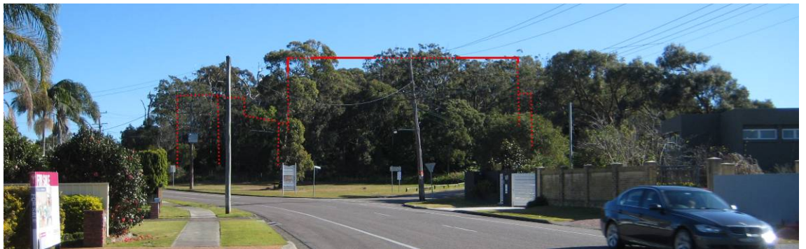
View A to North from Soldiers Point Road

Travelling north along Soldiers Point Road, views to the proposed development will be almost entirely screened from view by the existing vegetation on the reserve to the south. It will have minimal impact on views from the neighbouring residential development