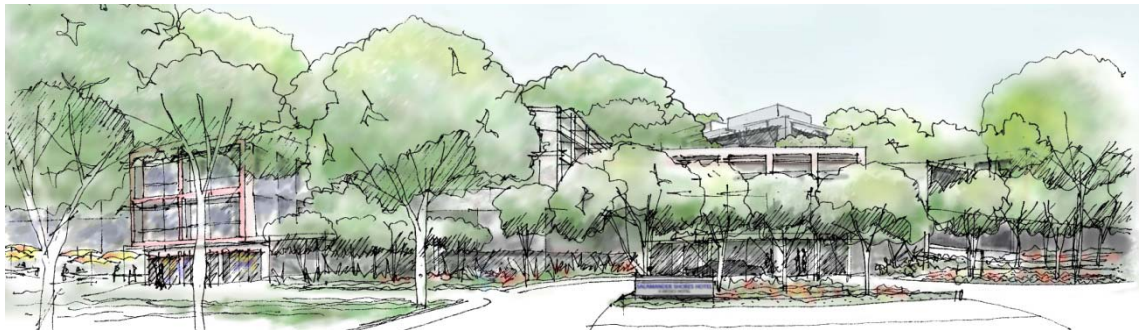
View B view South of proposed development from the Bowling Club

primary address and 'publicly active' portion of the new resort will be on the north west corner which contains the entry and porte cochere of the hotel, as well the public bar and cafes. This area contains significant existing vegetation which is being preserved, thereby providing a mature landscape setting for this area. Relocating all car parking under the development and the provision of a 20m landscape set back along Soldiers Point Road for new planting, will enable the extension of the existing southern tree vegetation to sweep into the site along the western site boundary, helping to screen the development from the road.