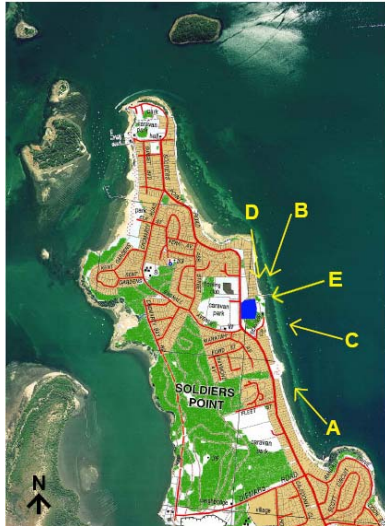
Key Plan – Coastal Impact Views

In general, the coastal hill and its vegetation provides significant screening of the development when viewed from the coast and the Port.