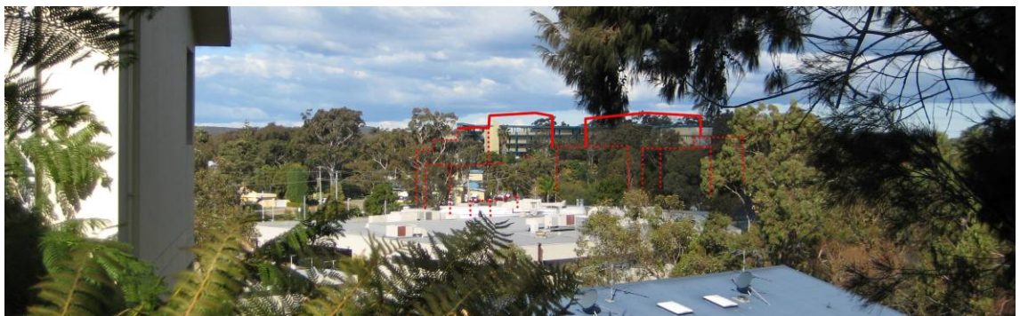
View C from North West residential area

The new resort is sited within a well landscaped setting surrounded on three sides by existing dense, mature vegetation that will ensure that the visual impact of the development will be minimum.