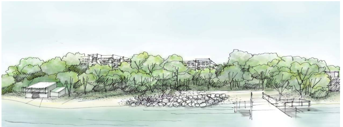
Sketch View E of proposed development from the jetty facing west (refer to View B above)