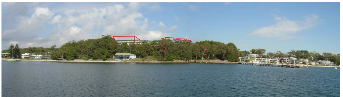
View C from Port Stephens facing west (refer to View B above)

From most locations off-shore facing west, the new development will be well screened by the existing vegetation and only the upper levels of the serviced and residential apartments will be visible. The proposed massing of the buildings provides breaks in the skyline which will ensure that the new buildings will be less visually intrusive than the linear massing of the existing resort when viewed from these off shore view points.