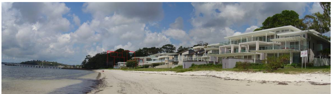
View D from the beach facing south

The dense existing vegetation to the north of the site in the reserve and the road corridor almost completely screens the proposed and existing resort developments from view. The existing three storey strip beach front housing dominates the coastal view at this location.