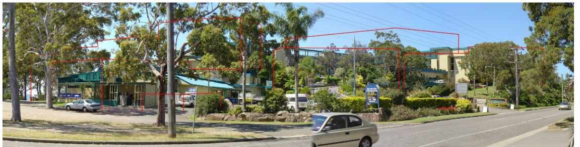
View B view South from Bowling Club

Travelling north along Soldiers Point Road, views to the proposed development will be almost entirely screened from view by the existing vegetation on the reserve to the south. It will have minimal impact on views from the neighbouring residential development