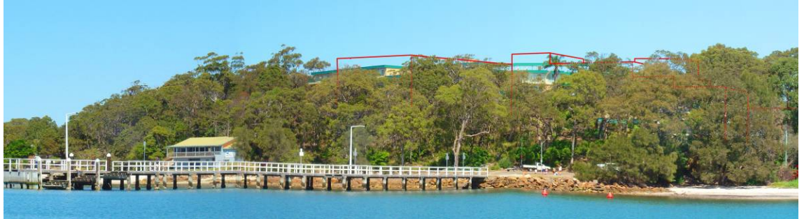
View B from Port Stephens facing south west

From most locations off-shore facing west, the new development will be well screened by the existing vegetation and only the upper levels of the serviced and residential apartments will be visible. The proposed massing of the buildings provides breaks in the skyline which will ensure that the new buildings will be less visually intrusive than the linear massing of the existing resort when viewed from these off shore view points.