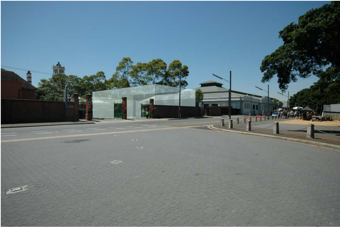
VIEW 1 - SITE A VIEWED FROM DRIVER AVENUE