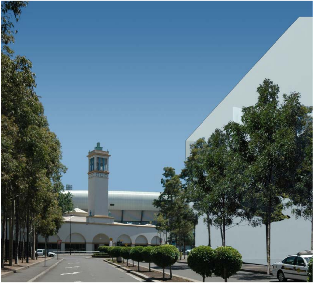
VIEW 3 - SITE C VIEWED ALONG ERROL FLYNN BOULEVARD