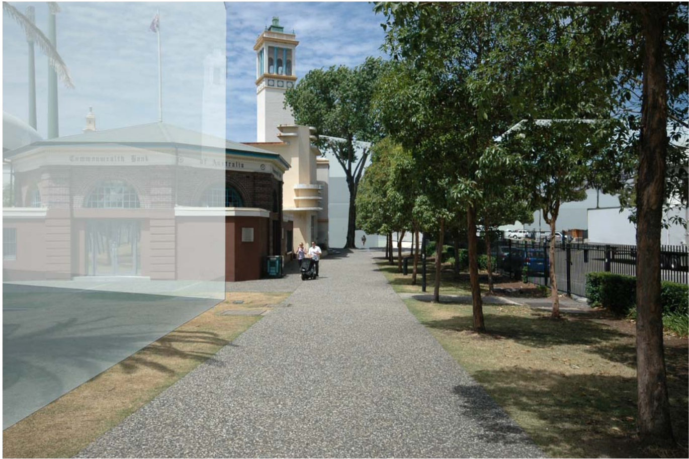
VIEW 2 - SITE A VIEWED ALONG CHELMSFORD AVENUE