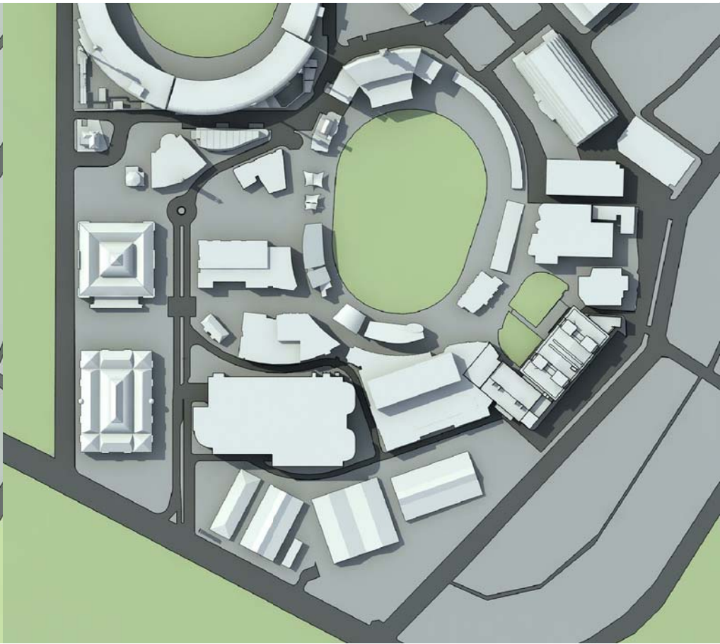
EQUINOX MARCH 21 - 3PM EXISTING