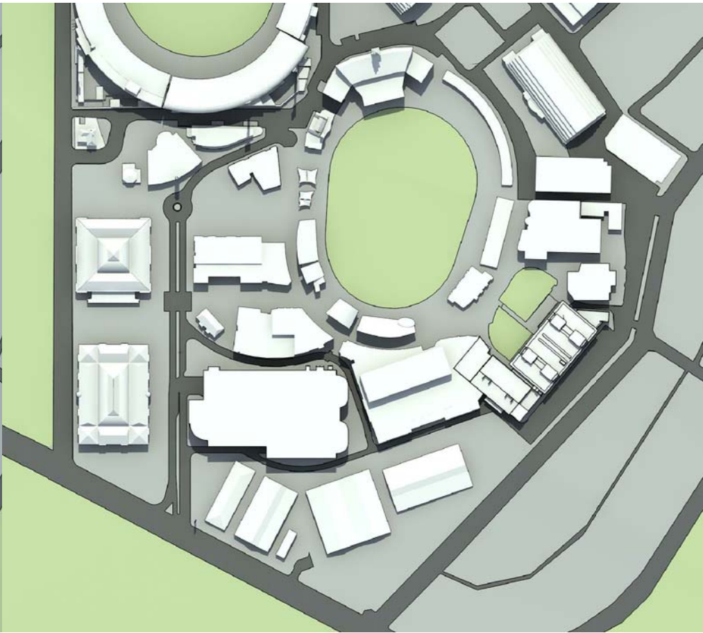
EQUINOX MARCH 21 - 12PM EXISTING