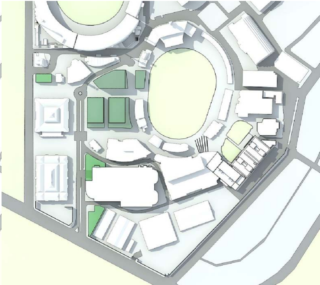
EQUINOX MARCH 21 - 3PM PROPOSED

Level 2, 204 Clarence Street, Sydney 2000 Australia Tel : 612 9267 9599 Fax : 612 9264 5844 Email : sydney@cox.com.au