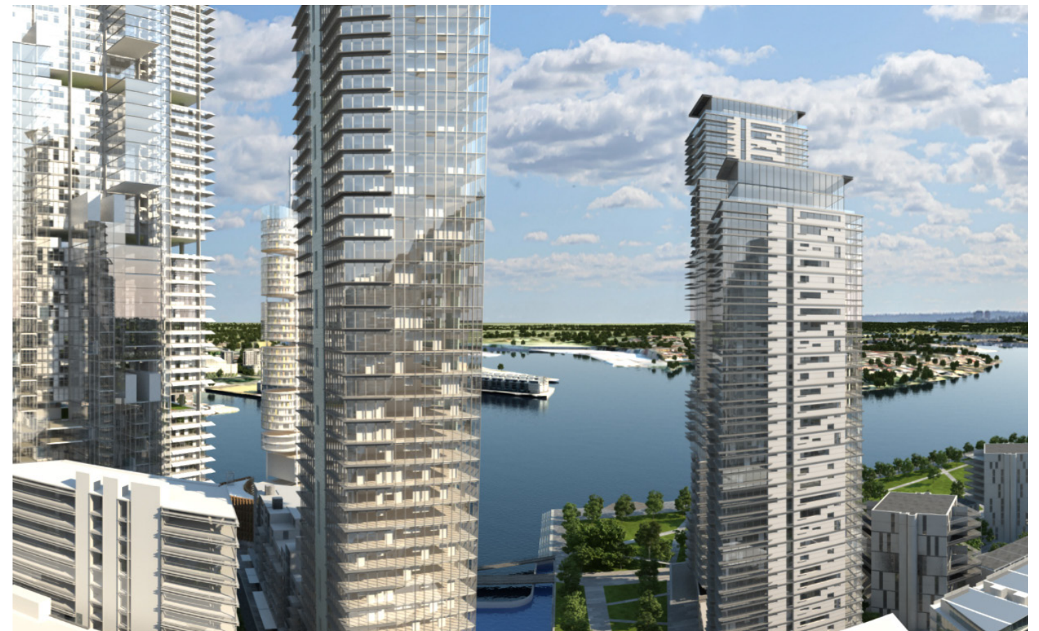
Provided from animation by Virtual Ideas