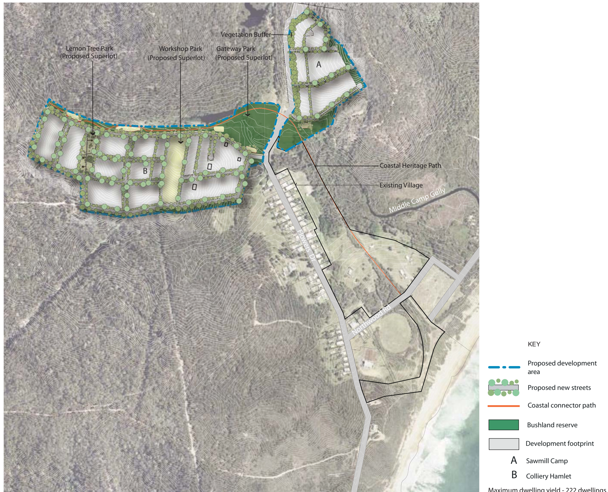
Figure A1.2.1 - Illustrative Concept Plan