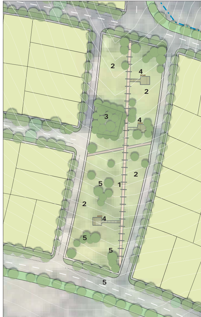
Figure B1.3.2 - Lemon Tree Park

The former manager's house is the site for an interpretive park with lawns and an interpretation of former gardens in the area. The remnants of previous uses such as terracing and plantings including a lemon tree are still evident.