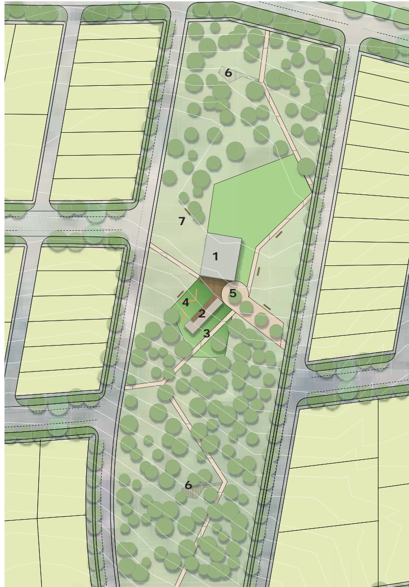
Figure B1.3.1 - Workshop Park

There are three key parks on the site and a linear park that follows the rail line/watercourse. All parks will be fully accessible to all members of the community at all times.