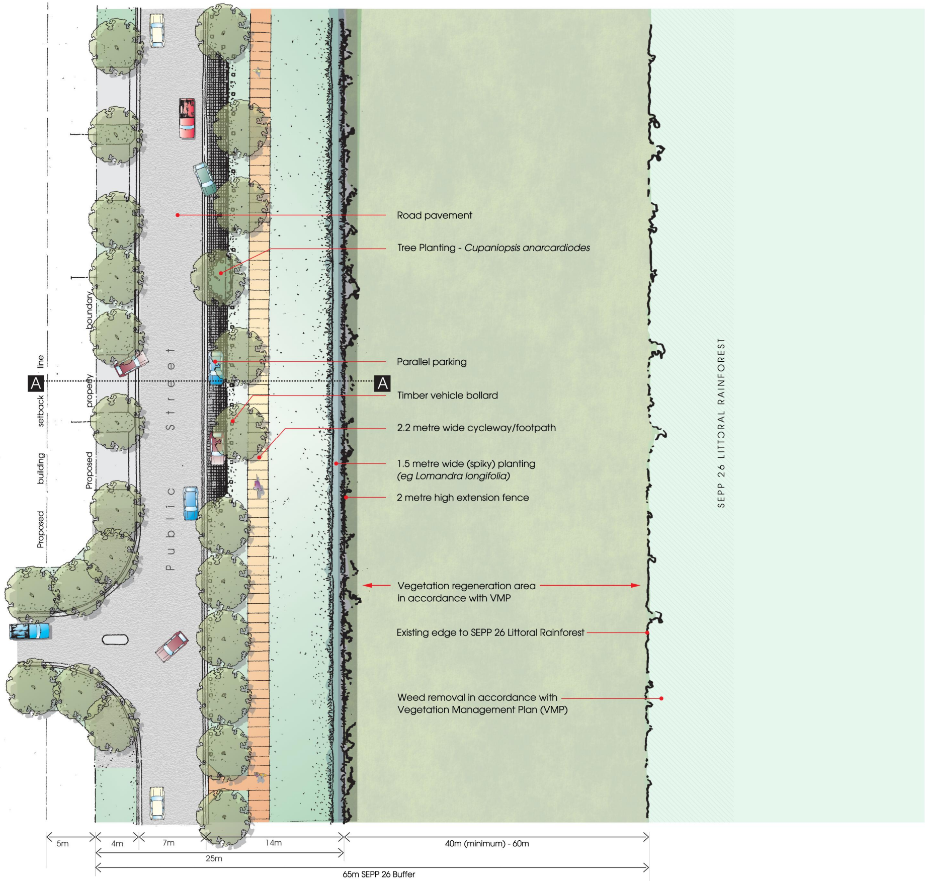
Indicative Edge Treatment Plan Scale 1: 400@A3