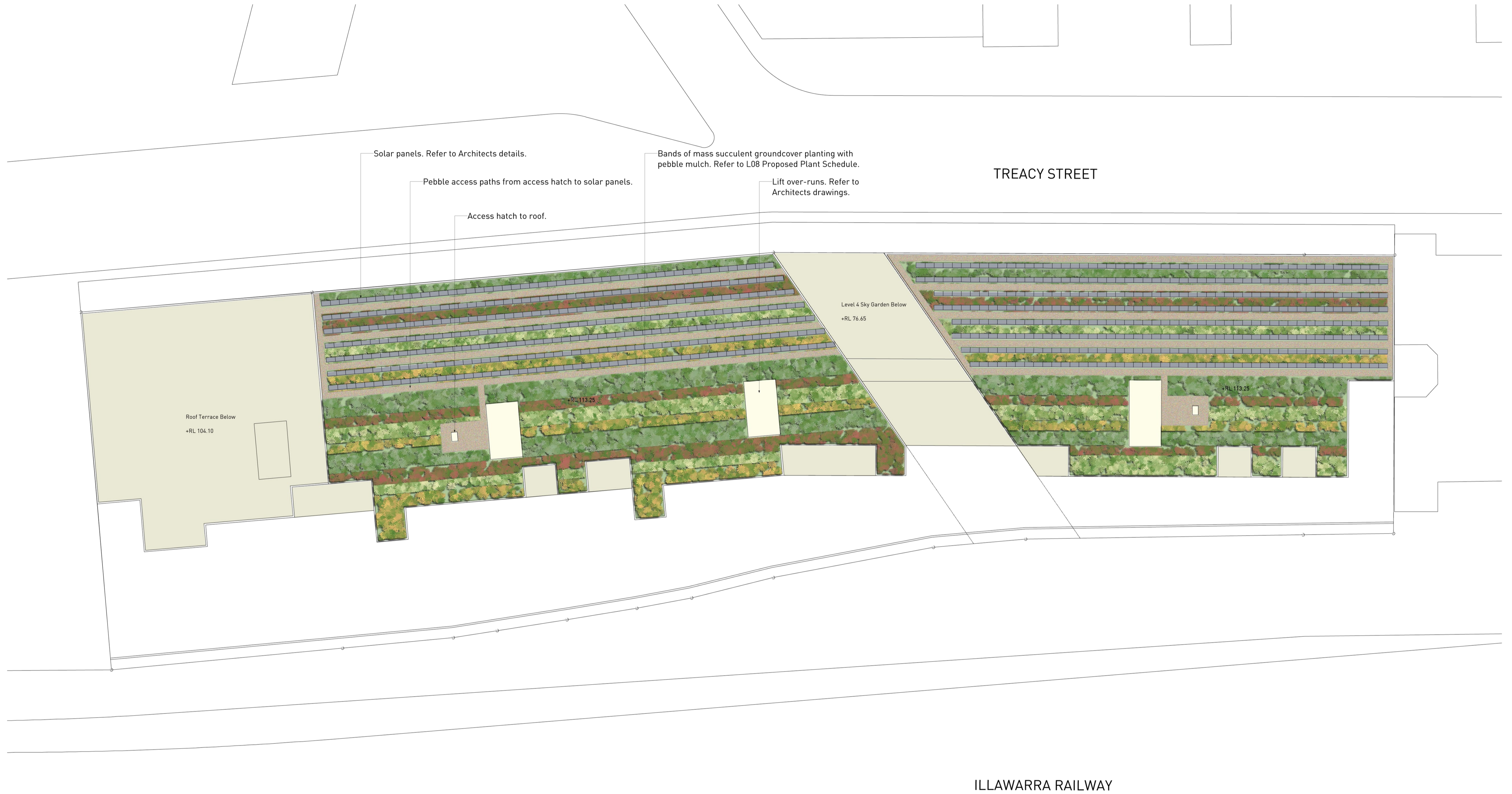
Solar panels with sedum groundcovers